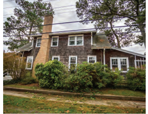
33 PENNSYLVANIA AVENUE 4 Bedrooms | 3 Baths | Sleeps 8 Screened Porch Rates: $1,500-$2,800/Week