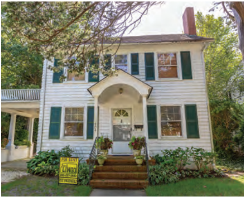
204 HICKMAN STREET 3 Bedrooms | 2.5 Baths | Sleeps 8 Screened Porch Rates: Call for Rates