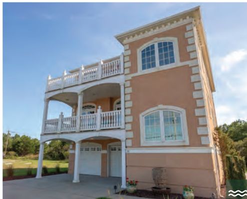
28 CAPE HENLOPEN DRIVE 4 Bedrooms | 3.5 Baths | Sleeps 8 Bay Views · Elevator Rates: $2,500-$3,500/Week