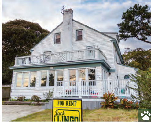
23 LAKE AVENUE 7 Bedrooms | 3 Baths | Sleeps 15 Ocean-Block · Pet-Friendly Rates: $4,100-$6,600/Week