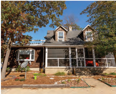
19 STOCKLEY STREET 3 Bedrooms | 2 Baths | Sleeps 8 Ocean-Block · Screened Porch Rates: Call for Rates