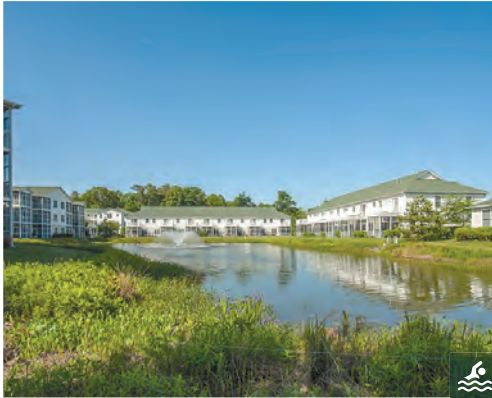
THE TIDES 2-4 Bedrooms | 2-3 Baths | Sleeps 6-8* Community Pool & Hot Tub · Screened Porch Rates: Call for Rates