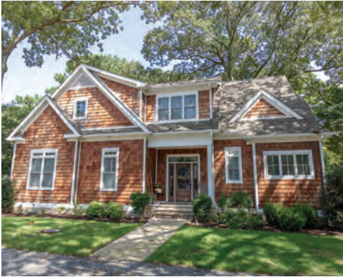
34 COLUMBIA AVENUE 5 Bedrooms | 5.5 Baths | Sleeps 10 Ocean-Block · Screened Porch Rates: $6,500-$8,500/Week

For more information, please call the Rehoboth Beach office at (302) 227 - 3883 or visit our website at www.JackLingo.com .