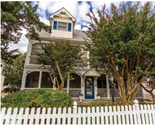
21D MARYLAND AVENUE Maryland Gardens 4 Bedrooms | 2 Baths | Sleeps 10 Ocean-Block · Screened Porch Rates: Call for Rates