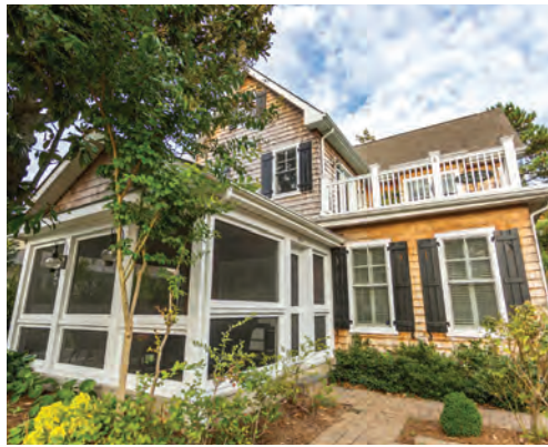
404 BAYARD AVENUE 4 Bedrooms | 3.5 Baths | Sleeps 10 Screened Porch Rates: Call for Rates