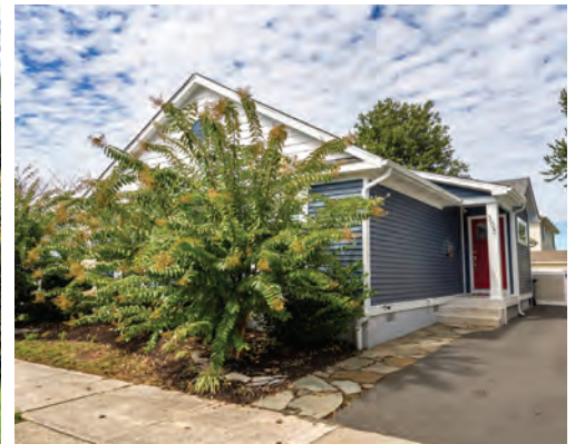
305 HICKMAN STREET 3 Bedrooms | 2 Baths | Sleeps 6 Screened Porch Rates: Call for Rates