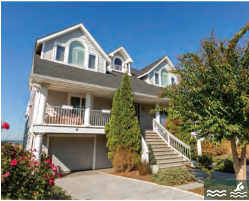
112 BREAKWATER REACH 5 Bedrooms | 4.5 Baths | Sleeps 15 Bay-Front · Sunroom · Community Pool Rates: $8,500-$9,500/Week