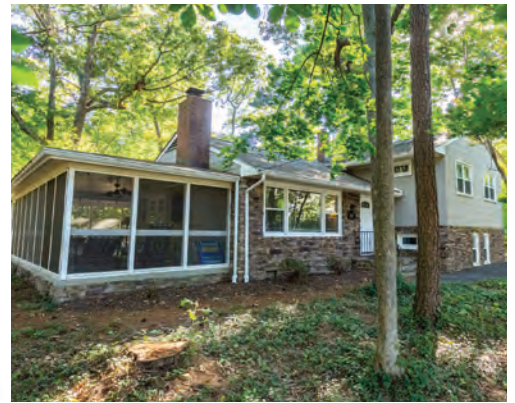
87 OAK AVENUE 5 Bedrooms | 3.5 Baths | Sleeps 10 Screened Porch Rates: $1,800-$4,650/Week