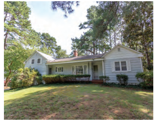
38 ROLLING ROAD 4 Bedrooms | 2 Baths | Sleeps 10 Screened Porch Rates: Call for Rates