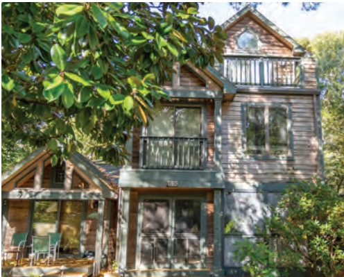
69 COLUMBIA AVENUE 4 Bedrooms | 3 Baths | Sleeps 12 Screened Porches Rates: Call for Rates