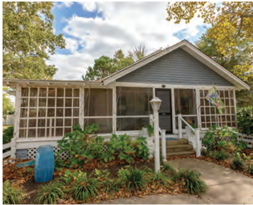
16 OAK AVENUE 4 Bedrooms | 3 Baths | Sleeps 10 Ocean-Block · Screened Porch · Guest House Rates: Call for Rates