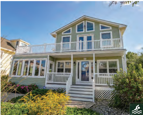
7 SANDPIPER 5 Bedrooms | 3.5 Baths | Sleeps 12 Community Pool · Sunroom Rates: $3,750-$4,000/Week