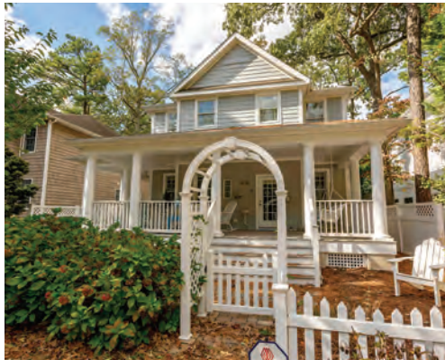
109 COLUMBIA AVENUE 5 Bedrooms | 5.5 Baths | Sleeps 10 Open Porch Rates: Call for Rates