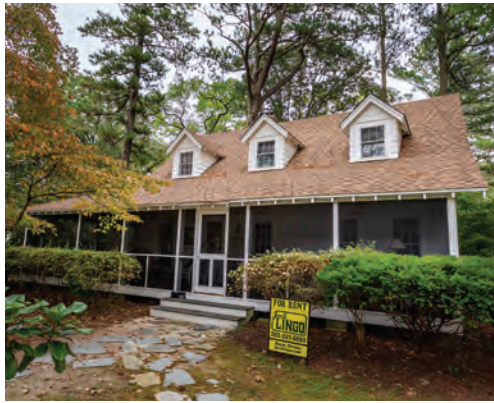
40 HENLOPEN AVENUE 4 Bedrooms | 2 Baths | Sleeps 10 Screened Porch Rates: $2,550-$4,000/Week