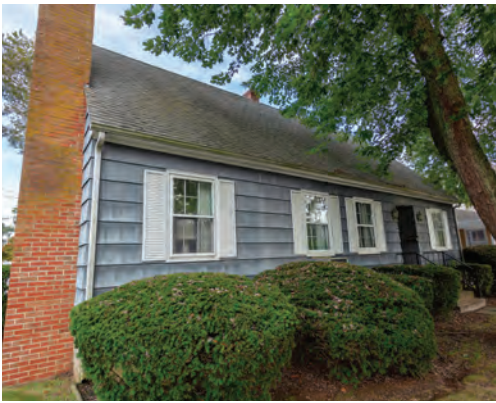
400 BAYARD AVENUE 4 Bedrooms | 2 Baths | Sleeps 10 Rates: Call for Rates