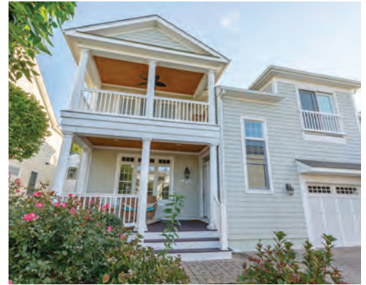
118D PHILADELPHIA STREET 6 Bedrooms | 5.5 Baths | Sleeps 14 Screened Porch Rates: Call for Rates