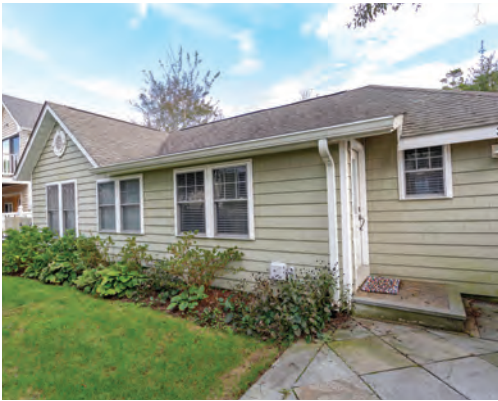
34B DELAWARE AVENUE 3 Bedrooms | 2 Baths | Sleeps 6 Patio Rates: $1,100-$2,300/Week