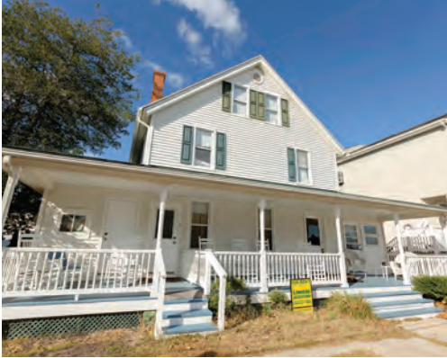
3 OLIVE AVENUE 7 Bedrooms | 4 Baths | Sleeps 18 Ocean-Block · Open Porch Rates: Call for Rates

For more information, please call the Rehoboth Beach office at (302) 227 - 3883 or visit our website at www.JackLingo.com.