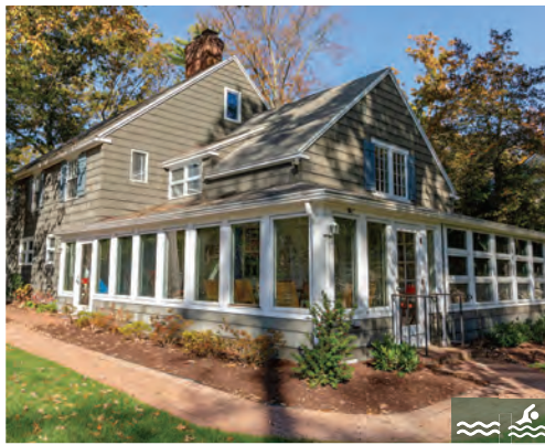
80 OAK AVENUE 6 Bedrooms | 4.5 Baths | Sleeps 12 Private Pool · Lake-Front · Sun Porches Rates: Call for Rates