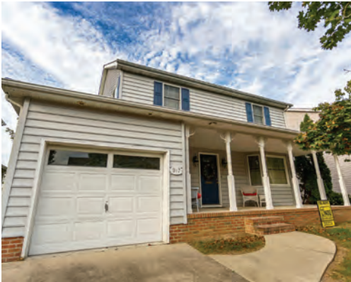
317 MUNSON STREET 3 Bedrooms | 2.5 Baths | Sleeps 10 Deck Rates: Call for Rates