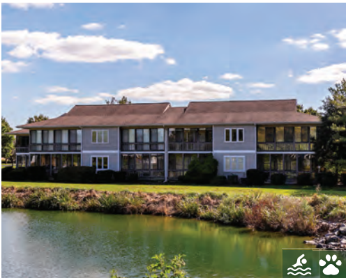
PLANTATIONS CONDOS & TOWNHOUSES 2 Bedrooms | 2 Baths | Sleeps 4-6 Community Pool & Tennis · Pet-Friendly Rates: $800-$1,250/Week