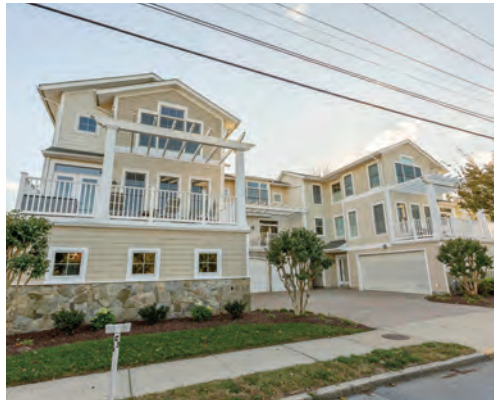
18 CHRISTIAN STREET 4-5 Bedrooms | 4 Baths | Sleeps 10-12 Deck Rates: $2,200-$4,500/Week