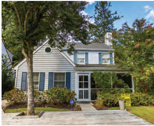
61 COLUMBIA AVENUE 4 Bedrooms | 3.5 Baths | Sleeps 9 Screened Porch Rates: $1,200-$3,550/Week