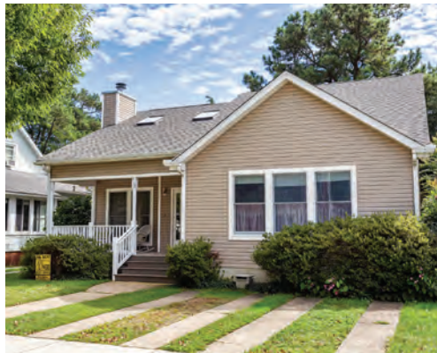
212 HICKMAN STREET 3 Bedrooms | 2.5 Baths | Sleeps 8 Screened Porch Rates: $2,650-$2,900/Week