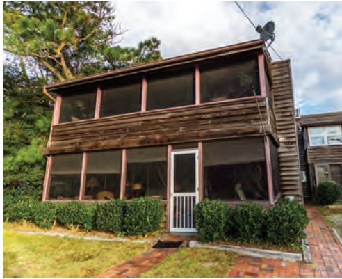
17 PHILADELPHIA STREET 2 Bedrooms | 1 Bath | Sleeps 6 Ocean-Block · Screened Porch Rates: Call for Rates