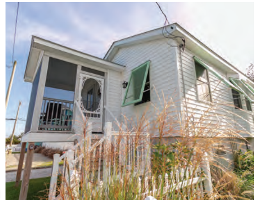
100 CEDAR AVENUE 1 Bedroom | 1 Bath | Sleeps 4 Screened Porch Rates: $850-$1,250/Week