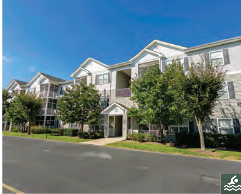
BAY CROSSING CONDOMINIUMS 2 Bedrooms | 2 Baths | Sleeps 4-6 Community Pool · Screened Porch Rates: $700-$1,000/Week