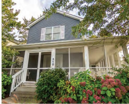
310 MUNSON STREET 4 Bedrooms | 3.5 Baths | Sleeps 8 Hot Tub · Screened Porch Rates: Call for Rates