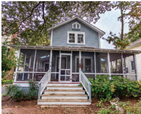
26 COLUMBIA AVENUE 5 Bedrooms | 3 Baths | Sleeps 12 Ocean-Block · Screened Porch · Guest Cottage Rates: Call for Rates