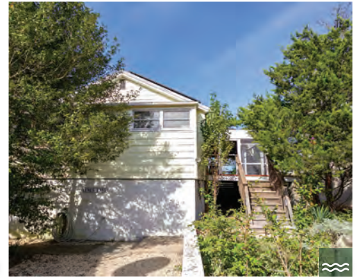
1106 BAY AVENUE 4 Bedrooms | 2 Baths | Sleeps 8 Bay-Front · Screened Porch · Rooftop Deck Rates: $2,550-$2,950/Week