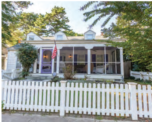
27 OAK AVENUE 4 Bedrooms | 3 Baths | Sleeps 10 Ocean-Block · Screened Porch Rates: Call for Rates