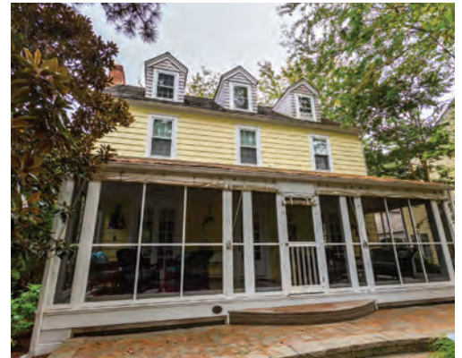
22 COLUMBIA AVENUE 5 Bedrooms | 3.5 Baths | Sleeps 13 Ocean-Block · Screened Porches Rates: Call for Rates