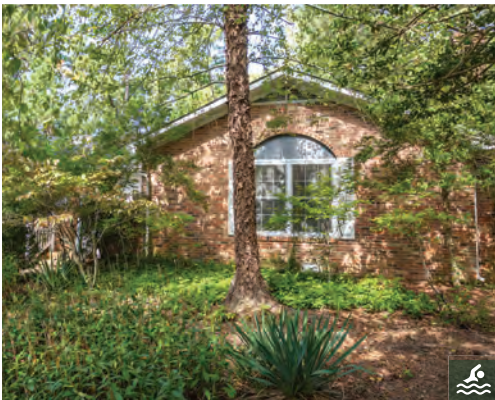
22 CEDAR ROAD 3 Bedrooms | 2 Baths | Sleeps 8 Screened Porch · Community Pool & Tennis Rates: Call for Rates