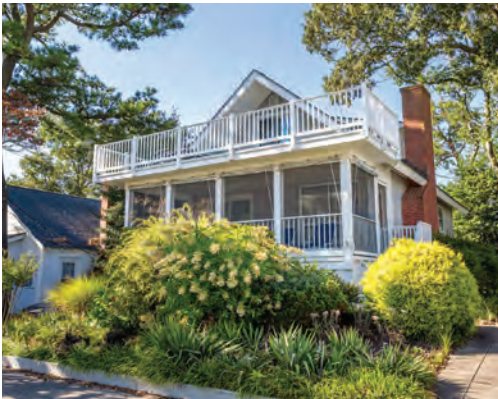
15.5 STOCKLEY STREET 3 Bedrooms | 2.5 Baths | Sleeps 8 Ocean-Block · Screened Porch Rates: $2,250-$3,900/Week