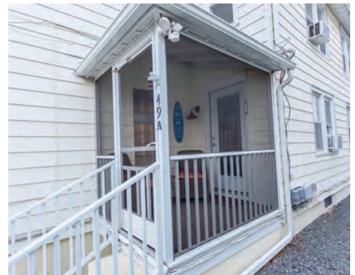
49A MARYLAND AVENUE 2 Bedrooms | 1 Bath | Sleeps 6 Screened Porch Rates: $1,300-$1,600/Week