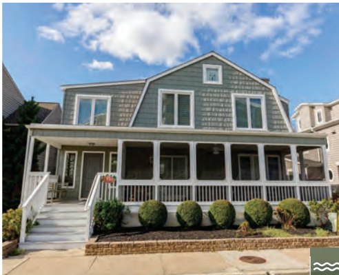
13 LAKE AVENUE 5 Bedrooms | 3.5 Baths | Sleeps 12 Ocean Views · Ocean-Block · Screened Porch Rates: Call for Rates