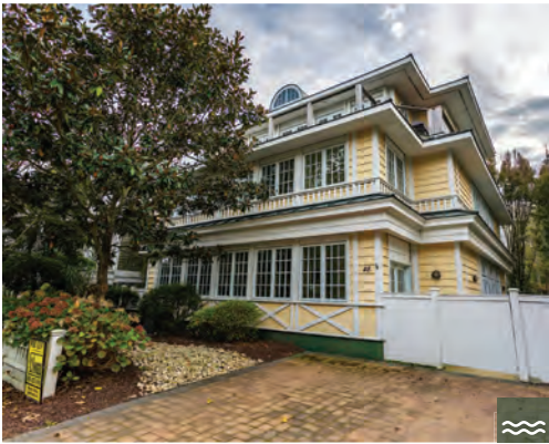
48 SURF AVENUE 5 Bedrooms | 6.5 Baths | Sleeps 13 Ocean Views · Elevator · Deck Rates: $2,500–$8,500/Week