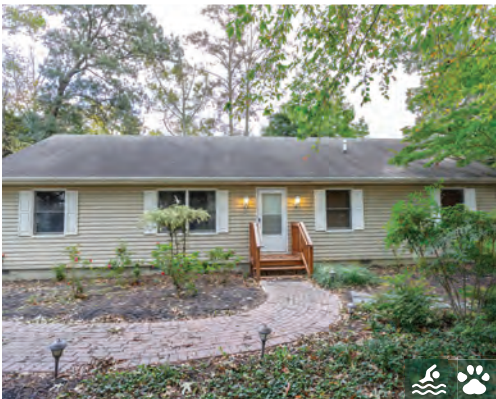
2 GARY AVENUE 3 Bedrooms | 2 Baths | Sleeps 8 Private Pool · Pet-Friendly Rates: $1,200-$1,800/Week