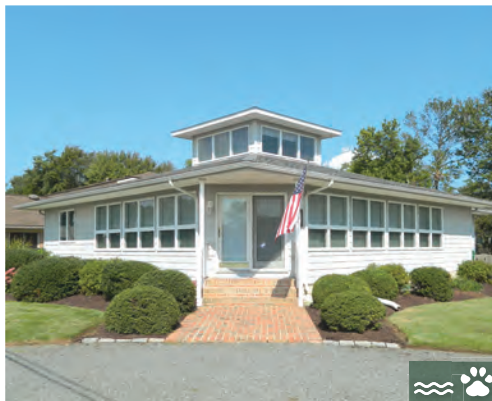
207 SALISBURY STREET 3 Bedrooms | 2.5 Baths | Sleeps 8 Pet-Friendly · Bay Views · Patio Rates: $2,075-$2,975/Week