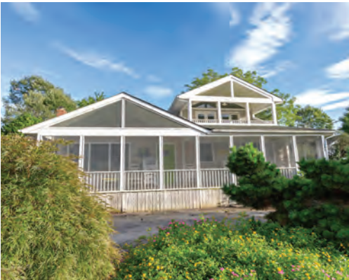
506 LEE STREET 4 Bedrooms | 3 Baths | Sleeps 8 Screened Porches Rates: Call for Rates