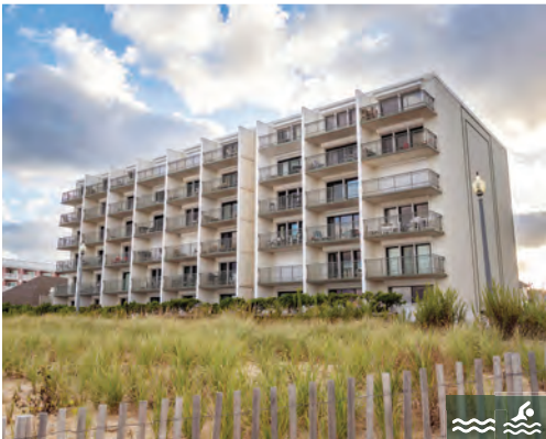
EDGEWATER HOUSE Studio | 1 Bath | Sleeps 2* Ocean-Front · Community Pool · Elevator Rates: Call for Rates