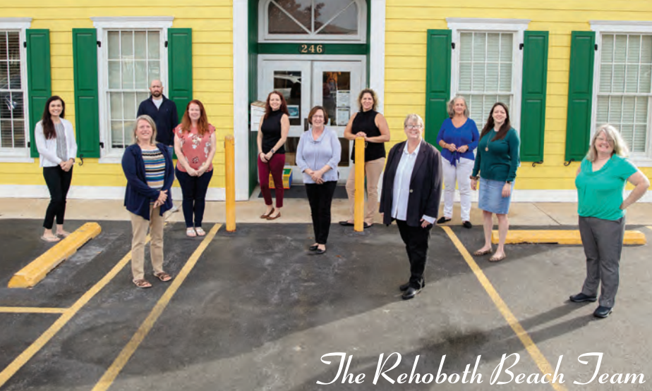
The Rehoboth Beach Team