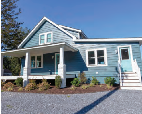
14787 COASTAL HIGHWAY 8 Bedrooms | 4.5 Baths | Sleeps 16 Fire Pit Rates: $2,750-$2,950/Week

For more information, please call the Lewes office at (302) 645 - 2207 or visit our website at www.JackLingo.com .