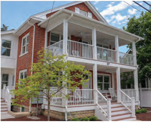
27 S 1 ST STREET 2 & 3 Bedrooms | 1 Bath | Sleeps 4-6 Ocean-Block · Open Porches Rates: $1,500-$2,800/Week