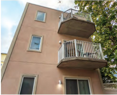
25A BALTIMORE AVENUE 4 Bedrooms | 2.5 Baths | Sleeps 10 Ocean-Block · Patio Rates: $3,000-$4,300/Week