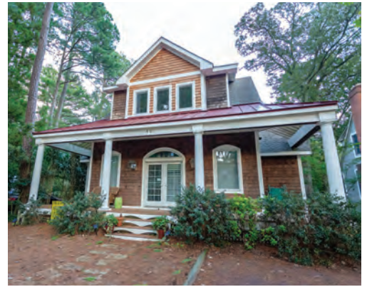
46 HENLOPEN AVENUE 4 Bedrooms | 3.5 Baths | Sleeps 12 Screened Porch Rates: $4,200-$6,700/Week