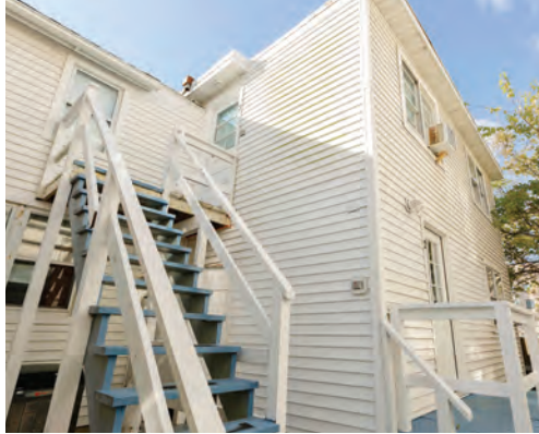
3 OLIVE AVENUE Apartments 1-2 Bedrooms | 1 Bath | Sleeps 4-6 Ocean-Block Rates: Call for Rates