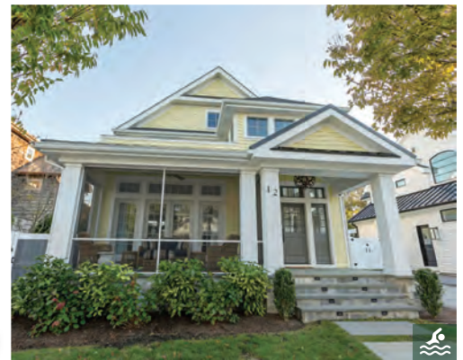
12 ST. LAWRENCE STREET 4 Bedrooms | 4.5 Baths | Sleeps 8 Ocean-Block · Private Pool · Screened Porch Rates: $7,500-$12,000/Week