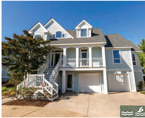
114 BREAKWATER REACH 5 Bedrooms | 4.5 Baths | Sleeps 10 Bay-Front · Hot Tub · Community Pool Rates: $5,500-$7,500/Week