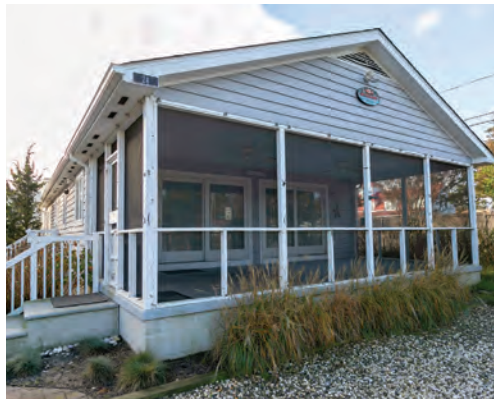
24 ST. LOUIS STREET 3 Bedrooms | 2 Baths | Sleeps 7 Ocean-Block · Screened Porch Rates: $1,900-$3,095/Week