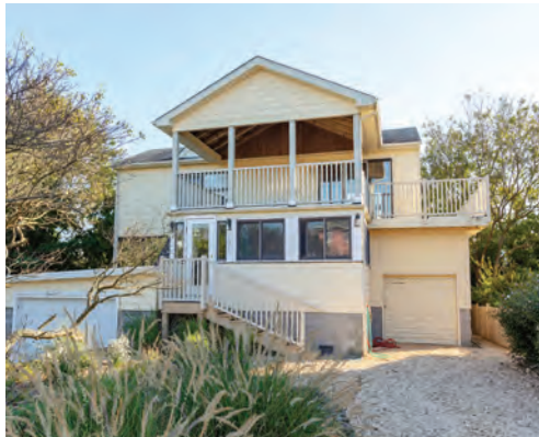
1515 BAY AVENUE 4 Bedrooms | 4 Baths | Sleeps 11 Bay-Front · Enclosed Porch Rates: $2,750-$3,000/Week