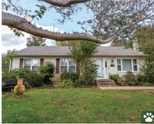
141 BEACH PLUM PLACE 3 Bedrooms | 2 Baths | Sleeps 6 Pet-Friendly Rates: $1,250-$1,600/Week