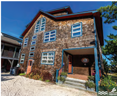
1 PENN STREET 7 Bedrooms | 6.5 Baths | Sleeps 17 Ocean-Front · Private Pool · Elevator Rates: Call for Rates