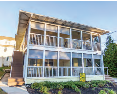
502C & D KING CHARLES AVENUE 2 Bedrooms | 2 Baths | Sleeps 6 Ocean-Block · Screened Porch Rates: $850-$2,150/Week