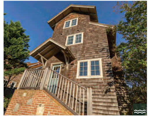
1 STOCKLEY STREET 5 Bedrooms | 5.5 Baths | Sleeps 12 Ocean-Front · Deck Rates: Call for Rates