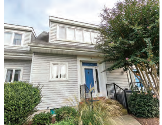
HENLOPEN GARDENS-TOWNHOMES 3 Bedrooms | 2.5 Baths | Sleeps 6-8 Rates: $750-$1,200/Week