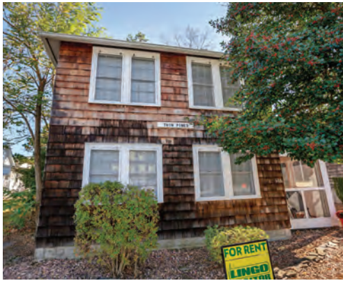
604 KING CHARLES AVENUE 3 Bedrooms | 3.5 Baths | Sleeps 6 Ocean-Block · Screened Porch Rates: Call for Rates