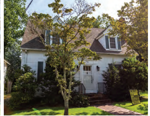
200 HICKMAN STREET 4 Bedrooms | 2 Baths | Sleeps 8 Enclosed Porch Rates: $1,750-$3,325/Week