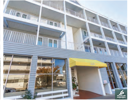
50 WILMINGTON AVENUE The Wilmington 2-3 Bedrooms | 2-2.5 Baths | Sleeps 6-9* Screened Porch · Elevator · Community Pool Rates: Call for Rates