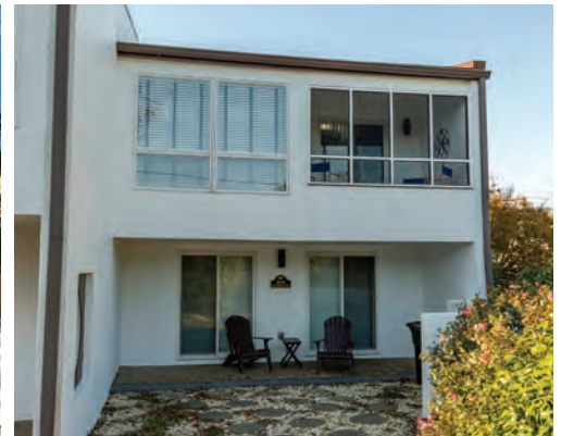
1 ST & DELAWARE AVENUE 3 Bedrooms | 2.5 Baths | Sleeps 6 Screened Porch Rates: Call for Rates