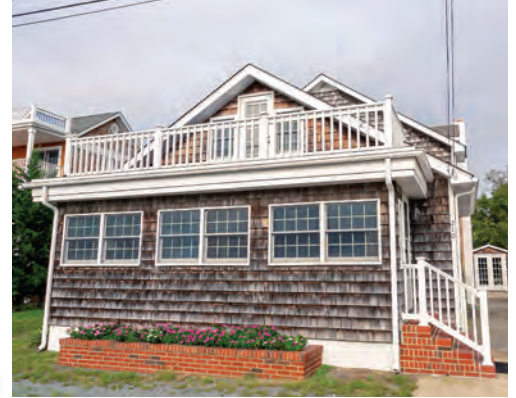
210 MIDLAND AVENUE 3 Bedrooms | 2.5 Baths | Sleeps 10 Florida Room Rates: $1,600-$2,600/Week