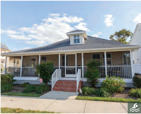
32 OLIVE AVENUE 6 Bedrooms | 3 Baths | Sleeps 16 Private Pool · Heated Spa · Screened Porch Rates: $1,800-$9,800/Week