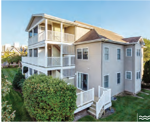
24D BROOKLYN AVENUE 5 Bedrooms | 3 Baths | Sleeps 12 Ocean Views · Screened Porch · Elevator Rates: $1,200-$5,275/Week