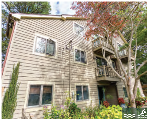
38321 MARTINS LANE 4 Bedrooms | 4 Baths | Sleeps 8 Lake-Front · Private Pool · Screened Porch Rates: Call for Rates