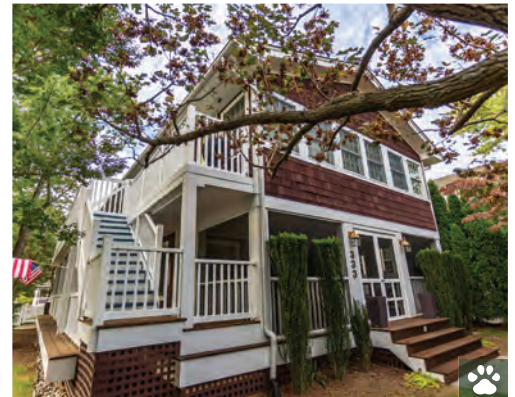
333 COUNTRY CLUB DRIVE 4 Bedrooms | 2 Baths | Sleeps 10 Pet-Friendly · Screened Porch Rates: $2,500-$3,800/Week