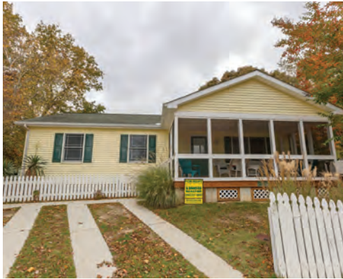
406 COUNTRY CLUB DRIVE 3 Bedrooms | 2 Baths | Sleeps 8 Screened Porch Rates: $850-$1,800/Week