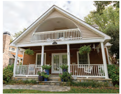
208 STATE ROAD 4 Bedrooms | 2 Baths | Sleeps 8 Screened Porch Rates: $1,850-$2,850/Week