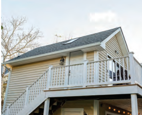
32B DELAWARE AVENUE Studio | 1 Bath | Sleeps 2 Garage Apartment Rates: $7,500/Season