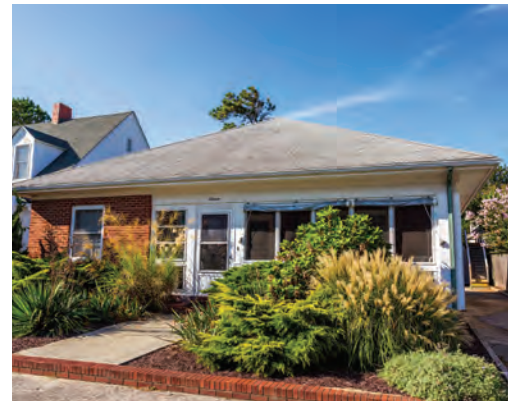
11 RODNEY STREET 5 Bedrooms | 2.5 Baths | Sleeps 13 Ocean-Block · Enclosed Porch Rates: $2,200-$4,200/Week