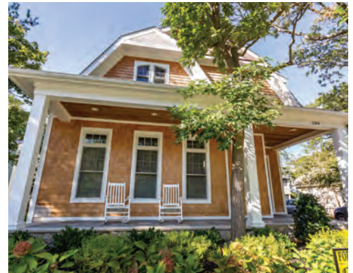
109 STOCKLEY STREET 5 Bedrooms | 5.5 Baths | Sleeps 12 Screened Porch Rates: $3,825-$9,175/Week