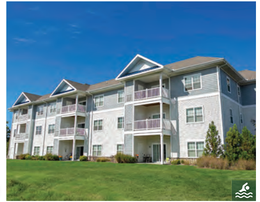
SANDBAR VILLAGE CONDOS 3 Bedrooms | 2 Baths | Sleeps 4-6 Community Pool · Elevator Rates: $800-$1,300/Week