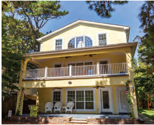
119 HOUSTON STREET 6 Bedrooms | 4 Baths | Sleeps 13 Open Porch · Deck Rates: Call for Rates