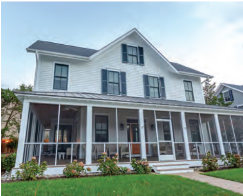
12 MARYLAND AVENUE 8 Bedrooms | 5 Baths | Sleeps 18 Ocean-Block · Screened Porch Rates: $7,500-$14,000/Week