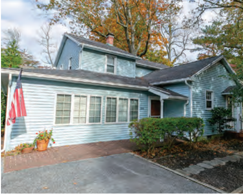
105 PARK AVENUE 5 Bedrooms | 3.5 Baths | Sleeps 12 Screened Porch Rates: Call for Rates

For more information, please call the Rehoboth Beach office at (302) 227 - 3883 or visit our website at www.JackLingo.com .