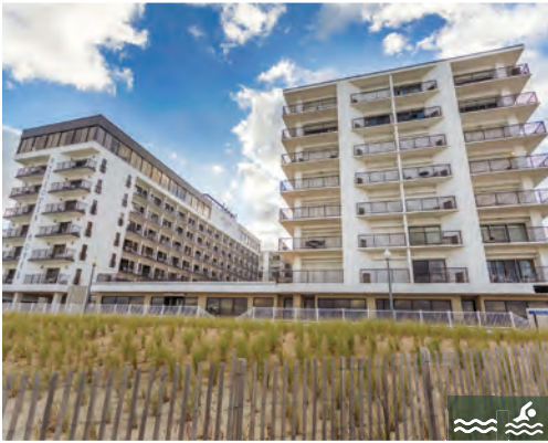
THE HENLOPEN 2 Bedrooms | 2 Baths | Sleeps 6* Ocean-Front · Community Pool · Elevator Rates: $850-$3,000/Week