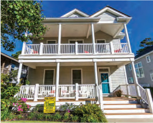
13 ST. LAWRENCE STREET 5 Bedrooms | 4.5 Baths | Sleeps 10 Ocean-Block · Open Porch · Deck Rates: Call for Rates

For more information, please call the Rehoboth Beach office at (302) 227 - 3883 or visit our website at www.JackLingo.com .