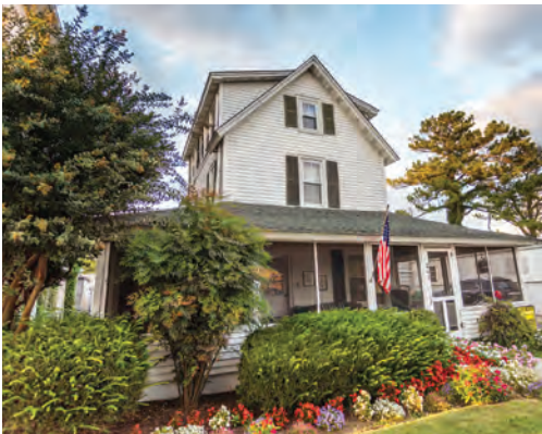
241 REHOBOTH AVENUE 5 Bedrooms | 2 Baths | Sleeps 10 Screened Porch Rates: Call for Rates