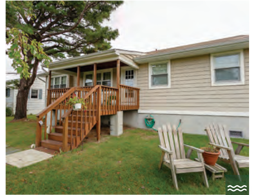
8 CAMDEN AVENUE 3 Bedrooms | 1.5 Baths | Sleeps 7 Wetland Views · Screened Porch Rates: $1,550-$2,025/Week