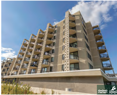
ONE VIRGINIA 0-2 Bedrooms | 1 Bath | Sleeps 4* Ocean Views · Community Pool · Elevator Rates: Call for Rates