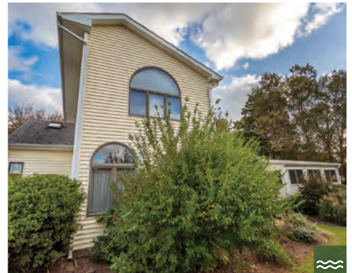
35A VIRGINIA AVENUE 2 Bedrooms | 2 Baths | Sleeps 5 Lake-Front Rates: Call for Rates