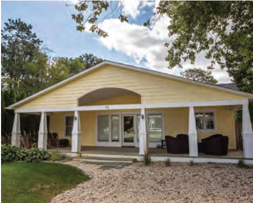
112 CHICAGO STREET 4 Bedrooms | 3 Baths | Sleeps 10 Screened Porch Rates: Call for Rates

For more information, please call the Rehoboth Beach office at (302) 227 - 3883 or visit our website at www.JackLingo.com.