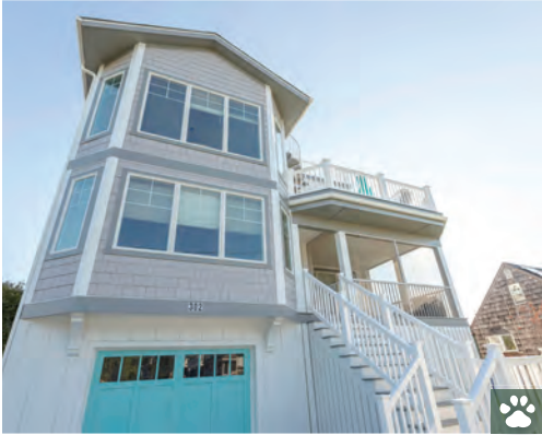
302 CEDAR STREET 5 Bedrooms | 4.5 Baths | Sleeps 13 Rooftop Deck · Pet-Friendly Rates: $2,750-$4,500/Week

For more information, please call the Lewes office at (302) 645 - 2207 or visit our website at www.JackLingo.com .