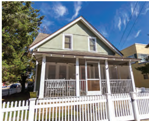
27 DELAWARE AVENUE 4 Bedrooms | 3 Baths | Sleeps 8 Ocean-Block · Screened Porch Rates: $1,750-$4,900/Week