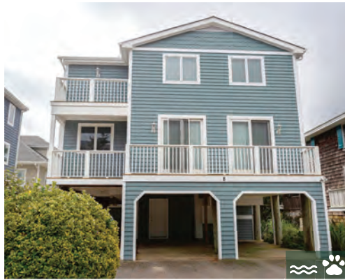
8 ST. LOUIS STREET 5 Bedrooms | 4.5 Baths | Sleeps 12 Ocean Views · Pet-Friendly · Screened Porch Rates: $3,800-$8,300/Week