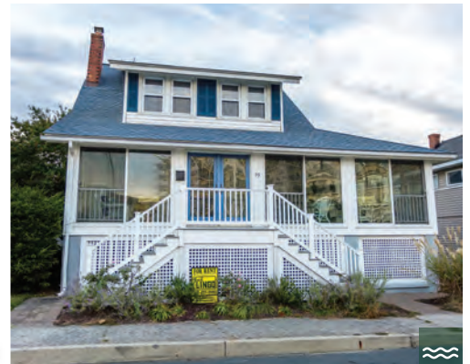
19 LAKE AVENUE 5 Bedrooms | 2.5 Baths | Sleeps 10 Ocean Views · Enclosed Porch Rates: Call for Rates