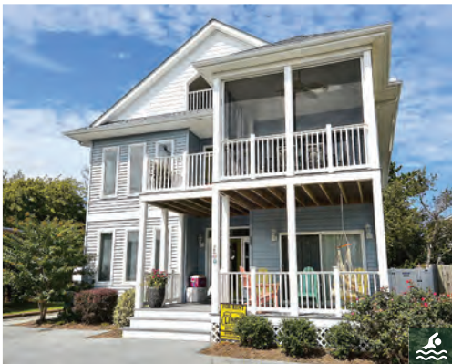
17 ST. LOUIS STREET 6 Bedrooms | 5.5 Baths | Sleeps 16 Ocean-Block · Private Pool · Screened Porch Rates: Call for Rates