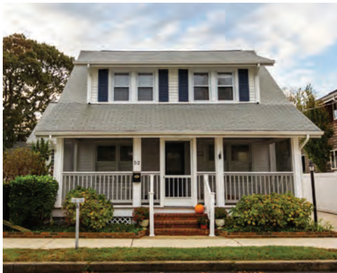
52 DELAWARE AVENUE 4 Bedrooms | 3 Baths | Sleeps 10 Screened Porch & Gazebo Rates: $2,500-$3,950/Week