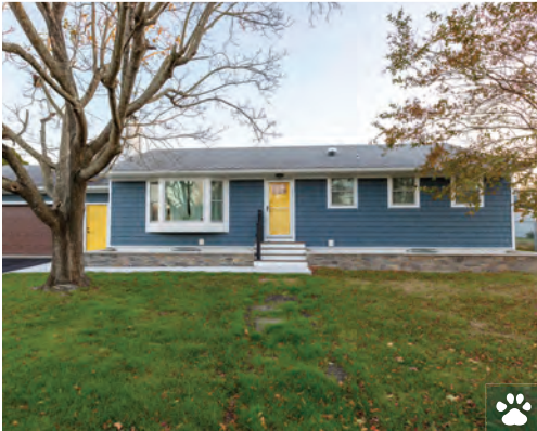
308 CARLA AVENUE 5 Bedrooms | 3 Baths | Sleeps 12 Pet-Friendly · Enclosed Porch · Deck Rates: $2,800-$4,500/Week

For more information, please call the Rehoboth Beach office at (302) 227 - 3883 or visit our website at www.JackLingo.com .