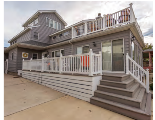
18 BROOKLYN AVENUE 5 Bedrooms | 3 Baths | Sleeps 14 Ocean-Block · Deck Rates: $2,350-$6,300/Week