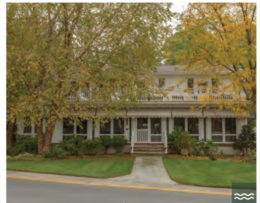
125 LAKE DRIVE 6 Bedrooms | 5 Baths | Sleeps 12 Lake-Front · Private Dock & Gazebo · Elevator Rates: $5,200-$7,450/Week