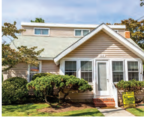
123 HICKMAN STREET 8 Bedrooms | 4 Baths | Sleeps 16 Screened Porches · Guest Cottage Rates: $4,600-$4,850/Week