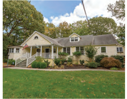
46 COLUMBIA AVENUE 6 Bedrooms | 4.5 Baths | Sleeps 12 Screened Porch · Garage Apartment Rates: Call for Rates