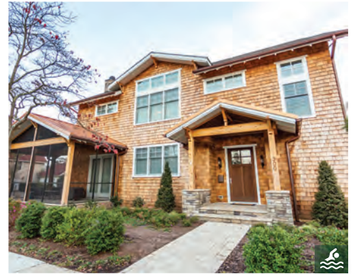
300 BAYARD AVENUE 5 Bedrooms | 4.5 Baths | Sleeps 12 Private Pool · Screened Porch Rates: Call for Rates