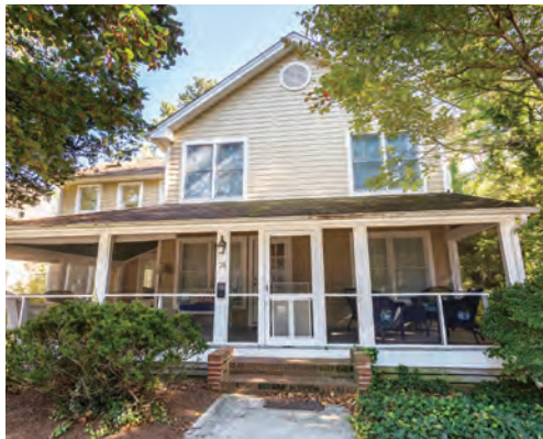
28 OAK AVENUE 7 Bedrooms | 4.5 Baths | Sleeps 14 Ocean-Block · Screened Porch Rates: Call for Rates