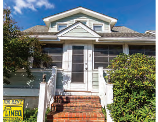
3 OAK AVENUE 5 Bedrooms | 4.5 Baths | Sleeps 10 Ocean-Block · Screened Porch Rates: Call for Rates