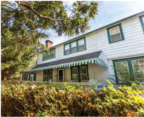
6 PARK AVENUE 6 Bedrooms | 4.5 Baths | Sleeps 14 Ocean-Block · Screened Porch Rates: Call for Rates