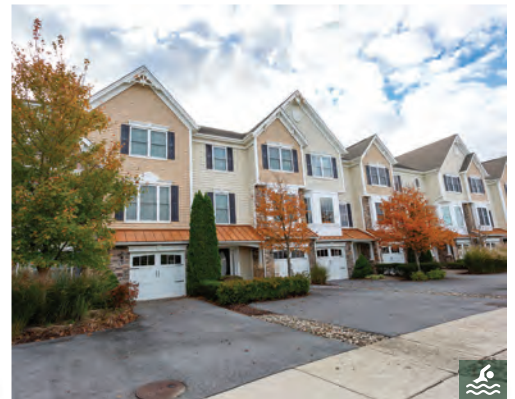
GRANDE AT CANAL POINTE 2-3 Bedrooms | 2 Baths | Sleeps 4-7* Community Pool & Tennis · Screened Porch · Playground & Fitness Center Rates: Call for Rates