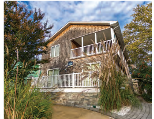
107 COUNTRY CLUB DRIVE 6 Bedrooms | 4 Baths | Sleeps 15 Screened Porch Rates: $2,150-$4,350/Week