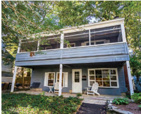
49 OAK AVENUE 3 Bedrooms | 2 Baths | Sleeps 8 Screened Porch Rates: $1,500-$2,500/Week