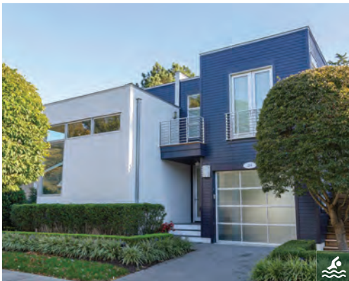
214 HICKMAN STREET 6 Bedrooms | 6.5 Baths | Sleeps 24 Private Pool Rates: Call for Rates