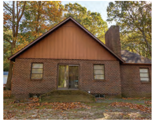
18793 SYLVAN DRIVE Piney Glade 3 Bedrooms | 2 Baths | Sleeps 8 Enclosed Porch Rates: Call for Rates