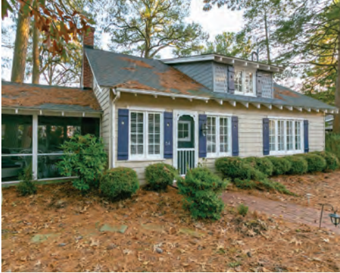
54 KENT STREET 4 Bedrooms | 2 Baths | Sleeps 10 Screened Porch Rates: Call for Rates

For more information, please call the Rehoboth Beach office at (302) 227 - 3883 or visit our website at www.JackLingo.com.