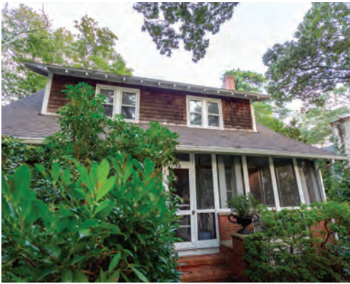
54 COLUMBIA AVENUE 5 Bedrooms | 2 Baths | Sleeps 10 Screened Porch Rates: Call for Rates