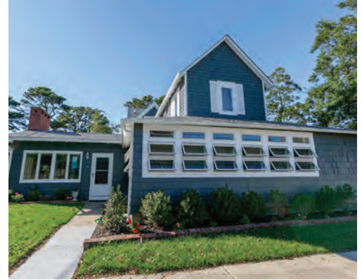
30 BROOKLYN AVENUE 5 Bedrooms | 2.5 Baths | Sleeps 12 Enclosed Porch Rates: $2,800-$4,000/Week