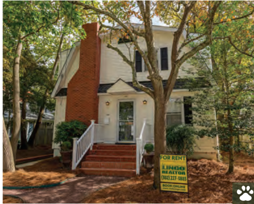
10 COOKMAN STREET 5 Bedrooms | 2 Baths | Sleeps 12 Pet-Friendly · Screened Porch Rates: $2,500-$5,000/Week