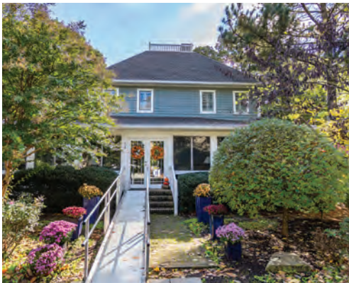
74 PARK AVENUE 4 Bedrooms | 4 Baths | Sleeps 8 Enclosed Porch Rates: Call for Rates