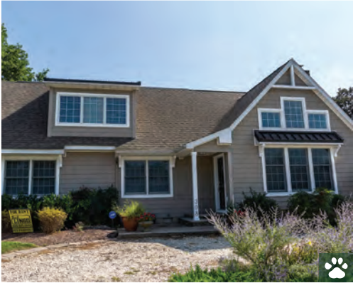
308 HICKMAN STREET 4 Bedrooms | 3 Baths | Sleeps 10 Pet-Friendly · Screened Porch Rates: $2,200-$3,700/Week

For more information, please call the Rehoboth Beach office at (302) 227 - 3883 or visit our website at www.JackLingo.com.