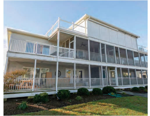
16B HOUSTON STREET 4 Bedrooms | 3 Baths | Sleeps 8 Ocean-Block · Screened Porch Rates: Call for Rates