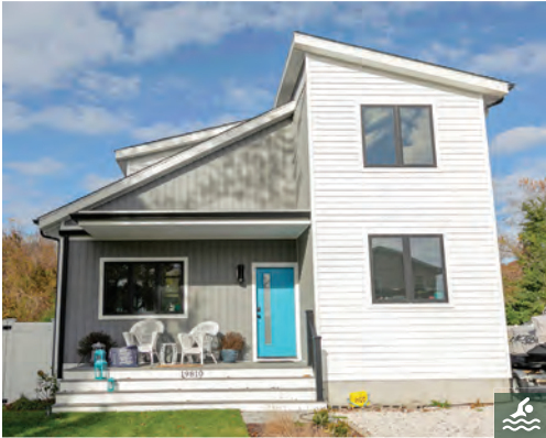
19810 HEBRON ROAD 5 Bedrooms | 4 Baths | Sleeps 10 Private Pool Rates: $5,000-$5,500/Week

For more information, please call the Rehoboth Beach office at (302) 227 - 3883 or visit our website at www.JackLingo.com .