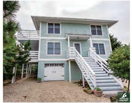
5 DUNES TERRACE 3 Bedrooms | 2.5 Baths | Sleeps 8 Community Pool Rates: $2,150-$2,950/Week