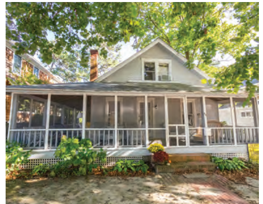
44 OAK AVENUE 4 Bedrooms | 2 Baths | Sleeps 10 Screened Porch Rates: Call for Rates