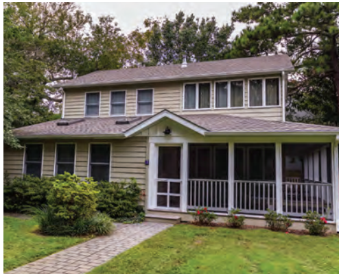
5 COLUMBIA AVENUE 3 Bedrooms | 2 Baths | Sleeps 6 Ocean-Block · Screened Porch · Sunroom Rates: Call for Rates