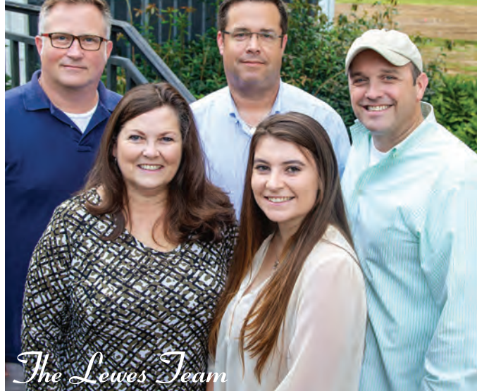
The Lewes Team