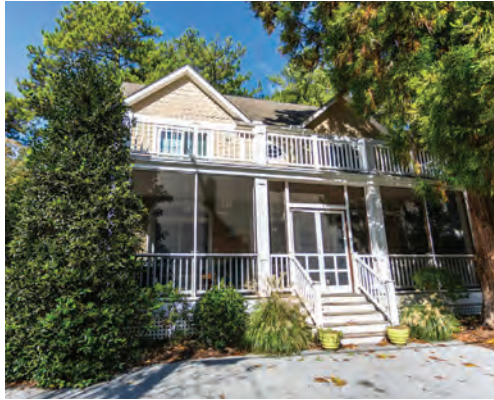
45 COLUMBIA AVENUE 5 Bedrooms | 4.5 Baths | Sleeps 15 Screened Porch Rates: Call for Rates