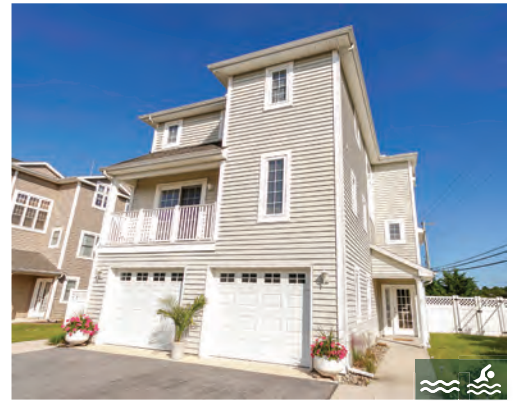
13 TEXAS AVENUE 5 Bedrooms | 5.5 Baths | Sleeps 10 Bay Views · Private Pool · Elevator Rates: $3,000-$4,500/Week