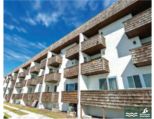
LEWES HARBOR 2 Bedrooms | 2 Baths | Sleeps 5 Canal-Front · Community Pool Rates: $775-$1,000/Week