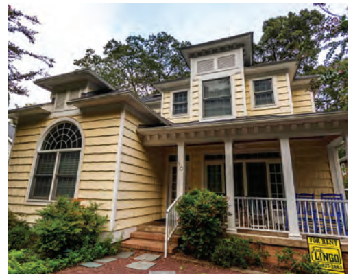
80 PARK AVENUE 5 Bedrooms | 4 Baths | Sleeps 10 Screened Porch Rates: $3,550–$5,950/Week