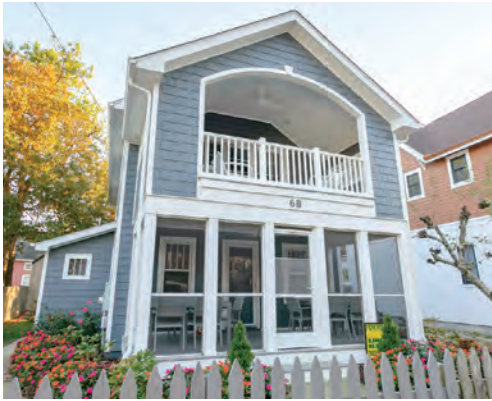
68 SUSSEX STREET 4 Bedrooms | 4 Baths | Sleeps 12 Screened Porch · Guest Cottage Rates: Call for Rates