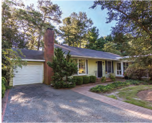
10 ROLLING ROAD 4 Bedrooms | 3.5 Baths | Sleeps 8 Ocean-Block · Screened Porch Rates: Call for Rates