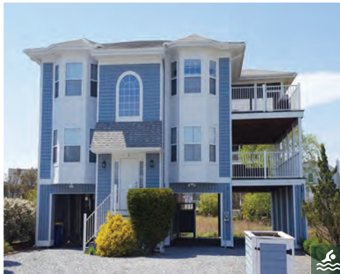
9 LIGHTHOUSE WAY 4 Bedrooms | 3 Bathrooms | Sleeps 10 Screened Porch · Community Pool Rates: $2,200-$3,500/Week