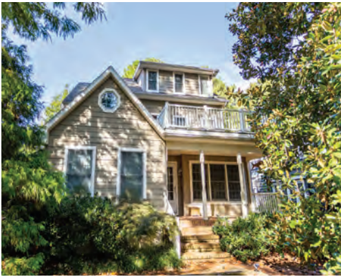
37 HENLOPEN AVENUE 4 Bedrooms | 3.5 Baths | Sleeps 8 Screened Porch Rates: Call for Rates