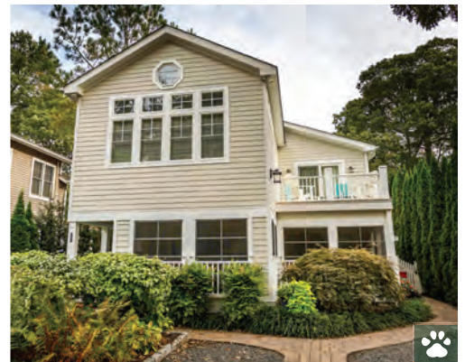
60 HENLOPEN AVENUE 5 Bedrooms | 4.5 Baths | Sleeps 10 Pet-Friendly · Enclosed Porch · Hot Tub Rates: $1,795-$6,500/Week