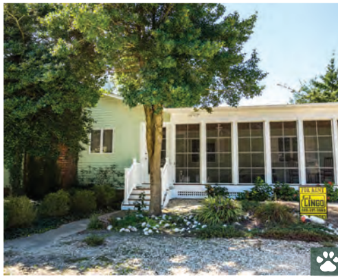
1603 BAYARD AVENUE 3 Bedrooms | 2 Baths | Sleeps 10 Pet-Friendly · Hot Tub · Screened Porch Rates: Call for Rates