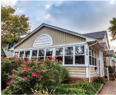
309 SCARBOROUGH AVENUE 6 Bedrooms | 3 Baths | Sleeps 11 Enclosed Porch · Deck Rates: $2,570-$4,700/Week