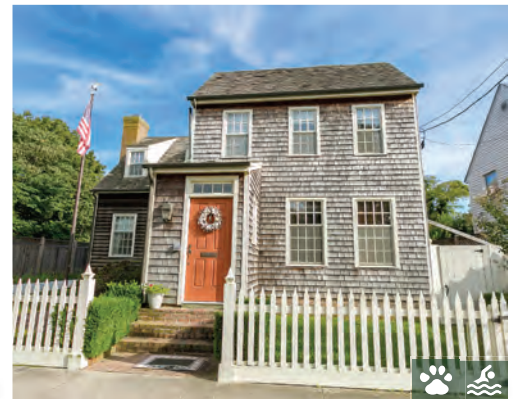
329 PARK AVENUE 4 Bedrooms | 3 Baths | Sleeps 11 Private Pool · Pet-Friendly · Guest House Rates: $2,795-$4,295/Week