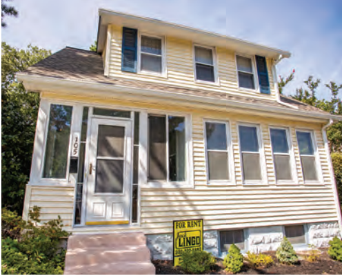
105 HICKMAN STREET 6 Bedrooms | 2.5 Baths | Sleeps 12 Screened Porch · Enclosed Porch Rates: Call for Rates

For more information, please call the Rehoboth Beach office at (302) 227 - 3883 or visit our website at www.JackLingo.com .