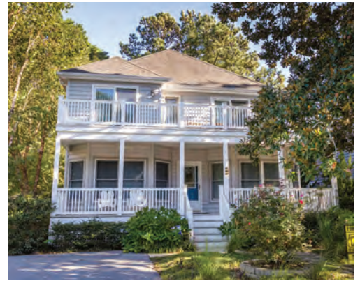
66 COLUMBIA AVENUE 5 Bedrooms | 4.5 Baths | Sleeps 12 Screened Porch Rates: $3,295-$4,995/Week