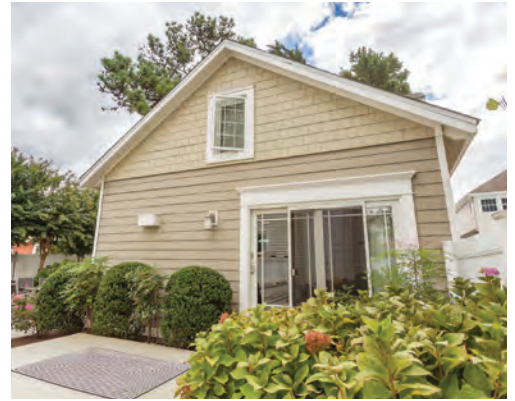
34B OLIVE AVENUE 2 Bedrooms | 1 Bath | Sleeps 4 Deck Rates: Call for Rates