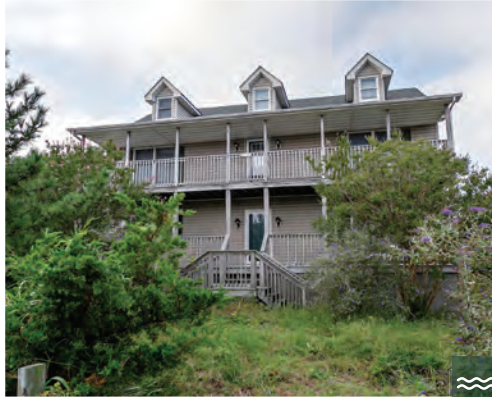
206 MASSACHUSETTS AVENUE 7 Bedrooms | 3 Baths | Sleeps 4 Wetland Views Rates: $1,750-$2,950/Week