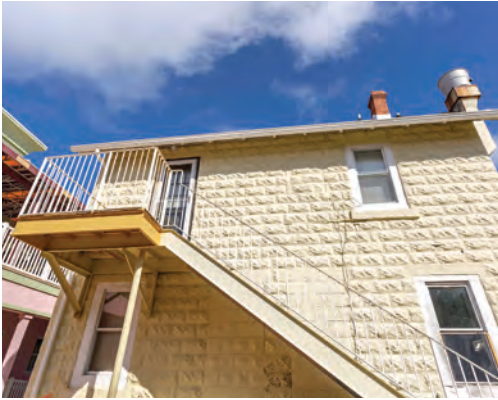
12 WILMINGTON AVENUE Second Floor 3 Bedrooms | 2 Baths | Sleeps 8 Ocean-Block Rates: Call for Rates

For more information, please call the Rehoboth Beach office at (302) 227 - 3883 or visit our website at www.JackLingo.com .