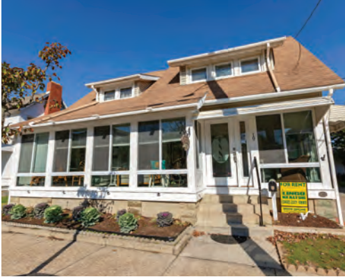
19 BROOKLYN AVENUE 4 Bedrooms | 2.5 Baths | Sleeps 8 Ocean-Block · Enclosed Porch Rates: $1,848-$3,849/Week

For more information, please call the Rehoboth Beach office at (302) 227 - 3883 or visit our website at www.JackLingo.com .