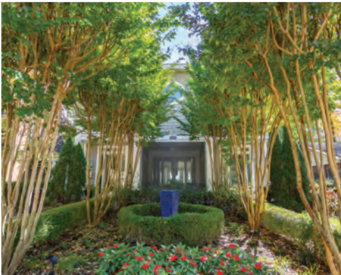
94 HENLOPEN AVENUE 6 Bedrooms | 5.5 Baths | Sleeps 12 Screened Porch Rates: $2,500-$6,000/Week