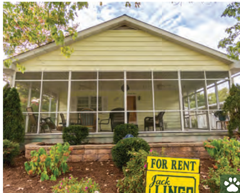
327 COUNTRY CLUB DRIVE 3 Bedrooms | 2 Baths | Sleeps 8 Pet-Friendly · Screened Porch Rates: Call for Rates