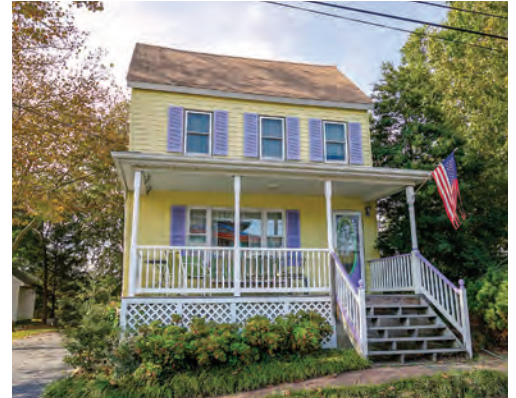
408 E MARKET STREET 3 Bedrooms | 3 Baths | Sleeps 8 Rates: $1,250-$1,900/Week