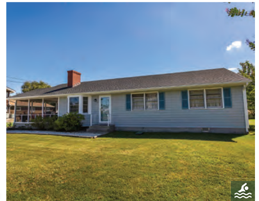
24 HARBOR ROAD 4 Bedrooms | 2 Baths | Sleeps 8 Screened Porch · Community Pool & Tennis Rates: Call for Rates