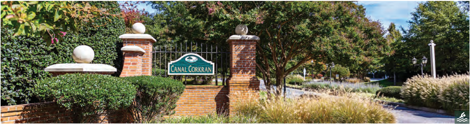
CANAL CORKRAN PREMIER COMMUNITY, WALKING DISTANCE TO CENTER OF REHOBOTH BEACH & BOARDWALK! Featuring: Townhomes, Duplexes, Custom Single-Family Homes, & Community Pool