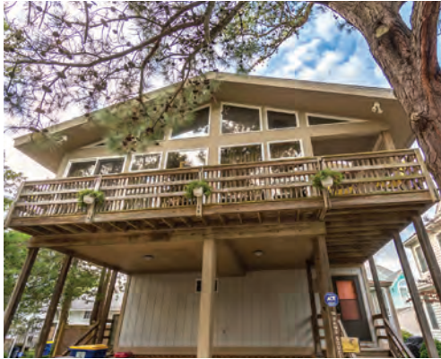
15 ST. LAWRENCE STREET 4 Bedrooms | 3 Baths | Sleeps 8 Ocean-Block · Deck Rates: $3,050-$3,495/Week