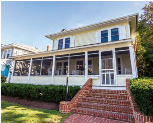
8 NORFOLK STREET 5 Bedrooms | 3.5 Baths | Sleeps 25 Ocean-Block · Screened Porch Rates: Call for Rates