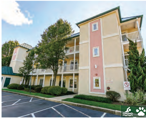
THE SUMMERLYN CONDOMINIUMS 3 Bedrooms | 2 Baths | Sleeps 4-6 Community Pool · Elevator · Pet-Friendly Rates: $800-$1,300/Week