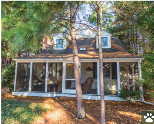
123 NORFOLK STREET 5 Bedrooms | 4 Baths | Sleeps 10 Pet-Friendly · Screened Porch Rates: $1,575-$4,750/Week