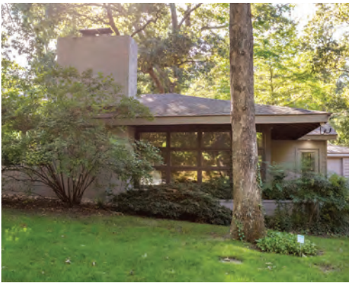
77 OAK AVENUE 4 Bedrooms | 3 Baths | Sleeps 8 Patio Rates: Call for Rates