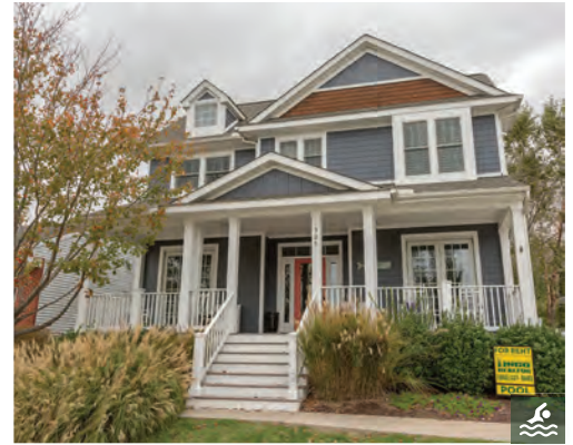
305 SANDALWOOD STREET 5 Bedrooms | 4.5 Baths | Sleeps 12 Private Pool · Outdoor Kitchen Rates: $7,000-$9,900/Week