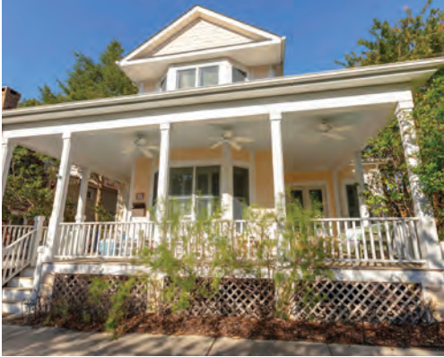
115 E FOURTH STREET 4 Bedrooms | 3.5 Baths | Sleeps 9 Wrap-Around Porch Rates: $1,850-$3,250/Week

For more information, please call the Lewes office at (302) 645 - 2207 or visit our website at www.JackLingo.com .