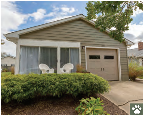
222 STATE ROAD 3 Bedrooms | 2 Baths | Sleeps 8 Pet-Friendly · Sunroom Rates: $21,000/Season