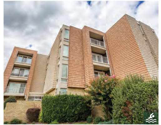
THE CREST-11 VIRGINIA AVENUE 1-2 Bedrooms | 1-2 Baths | Sleeps 4-6* Ocean-Block · Community Pool · Elevator Rates: Call for Rates