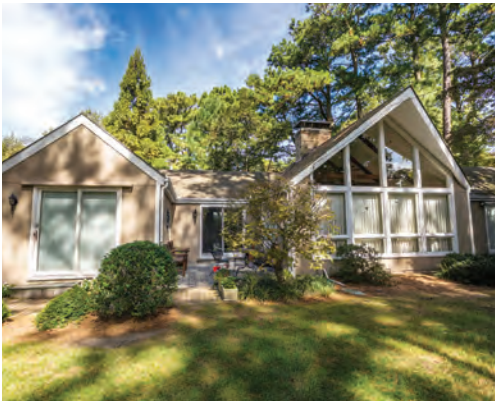
60 FIELDS END ROAD 4 Bedrooms | 3 Baths | Sleeps 8 Enclosed Porch Rates: Call for Rates