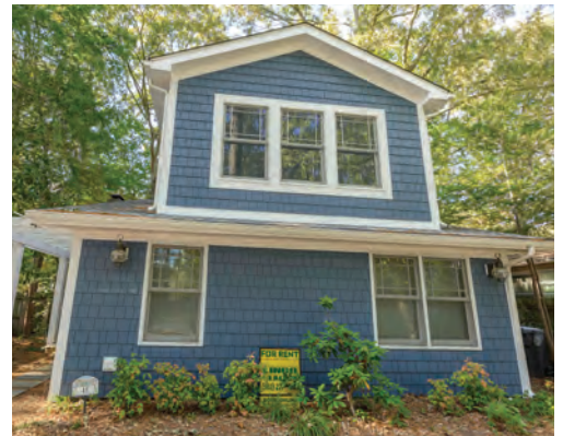
41 KENT STREET 6 Bedrooms | 3 Baths | Sleeps 12 Screened Porch Rates: Call for Rates