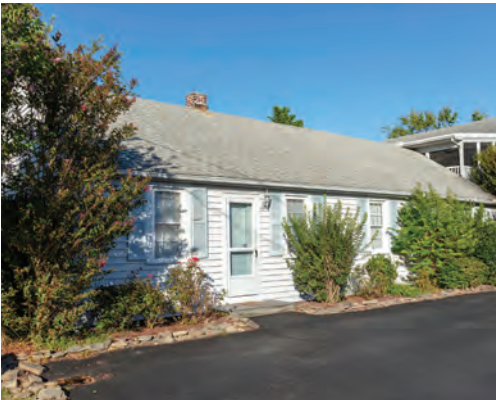
11 MICHIGAN AVENUE 3 Bedrooms | 2 Baths | Sleeps 8 Bay-Block Rates: $1,750-$2,350/Week