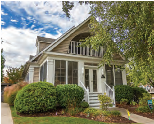
401 COUNTRY CLUB DRIVE 4 Bedrooms | 2 Baths | Sleeps 8 Enclosed Porch Rates: Call for Rates

For more information, please call the Rehoboth Beach office at (302) 227 - 3883 or visit our website at www.JackLingo.com.