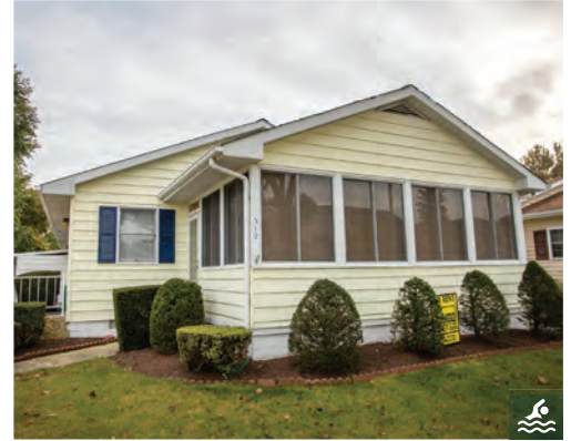
312 MUNSON STREET 3 Bedrooms | 2 Baths | Sleeps 8 Private Pool · Enclosed Porch Rates: $1,400-$3,600/Week