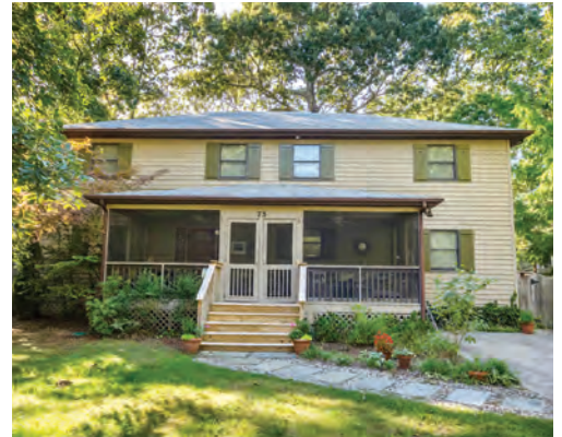
73 OAK AVENUE 5 Bedrooms | 3.5 Baths | Sleeps 10 Screened Porch Rates: Call for Rates