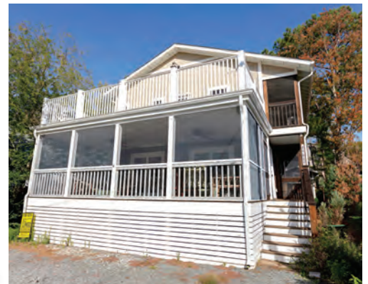
20637 DAISEY ROAD 4 Bedrooms | 4.5 Baths | Sleeps 8 Screened Porches Rates: $1,500-$1,900/Week