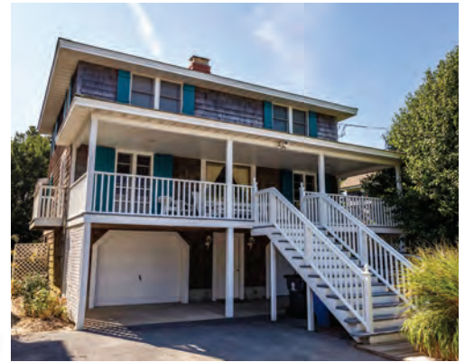
10 ST. LOUIS STREET 5 Bedrooms | 2.5 Baths | Sleeps 10 Ocean-Block · Elevator · Screened Porch Rates: Call for Rates