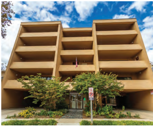
23 MARYLAND AVENUE Tidewater House 2 Bedrooms | 2 Baths | Sleeps 4-6* Ocean-Block · Elevator · Deck Rates: Call for Rates