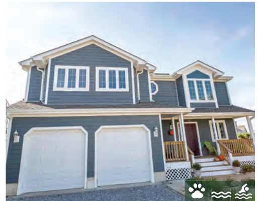
104 W CAPE SHORES 5 Bedrooms | 3 Baths | Sleeps 9 Bay Views · Pet-Friendly · Community Pool Rates: $2,400-$4,375/Week