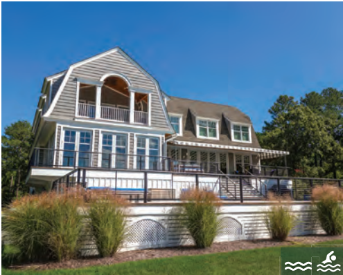
81 ANCHOR ROAD 5 Bedrooms | 5.5 Baths | Sleeps 10 Canal-Front · Private Pool & Hot Tub Rates: Call for Rates

For more information, please call the Rehoboth Beach office at (302) 227 - 3883 or visit our website at www.JackLingo.com .