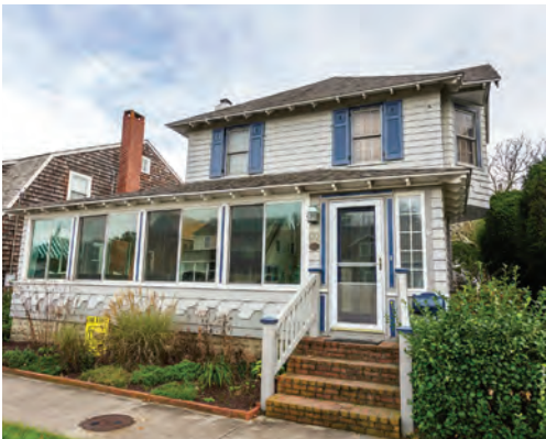
12 PENNSYLVANIA AVENUE 6 Bedrooms | 4 Baths | Sleeps 14 Ocean-Block · Enclosed Porch · Rooftop Deck Rates: $2,900-$6,650/Week