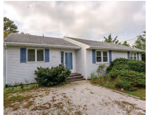
1402 CEDAR AVENUE 3 Bedrooms | 2.5 Baths | Sleeps 8 Rates: $1,350-$1,850/Week