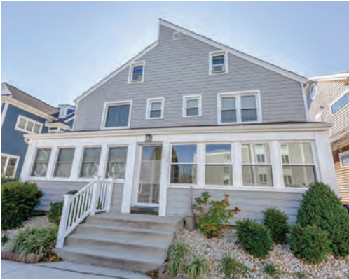
58 MARYLAND AVENUE Seabright 2 Bedrooms | 1 Bath | Sleeps 6* Sun Porch Rates: $850-$1,295/Week

For more information, please call the Rehoboth Beach office at (302) 227 - 3883 or visit our website at www.JackLingo.com .