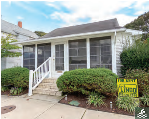
48 DELAWARE AVENUE 4 Bedrooms | 3 Baths | Sleeps 10 Private Pool · Screened Porch Rates: $1,850-$5,600/Week