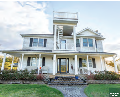
600 PILOTTOWN ROAD 5 Bedrooms | 2.5 Baths | Sleeps 12 Canal-Front · Private Dock & Boathouse · Screened Porch Rates: $3,000-$4,250/Week