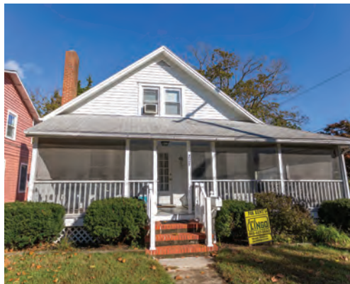
209 MUNSON STREET 4 Bedrooms | 2 Baths | Sleeps 12 Screened Porch Rates: Call for Rates