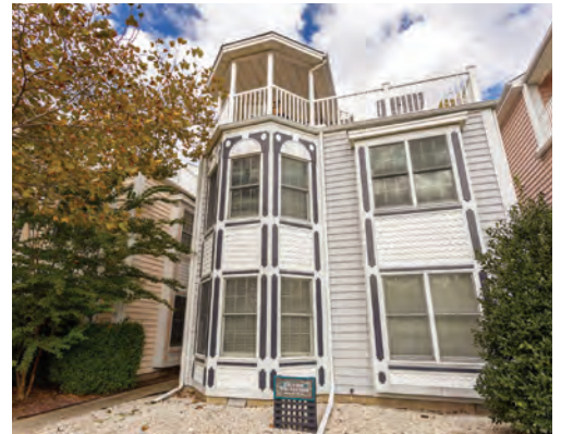
13B MARYLAND AVENUE 6 Bedrooms | 5 Baths | Sleeps 14 Ocean-Block · Deck Rates: $2,500-$6,600/Week