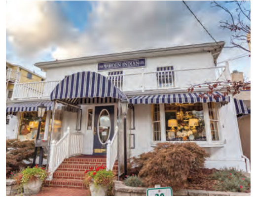
25B BALTIMORE AVENUE Second Floor 3 Bedrooms | 2 Baths | Sleeps 8 Ocean-Block · Enclosed Porch Rates: $1,950-$2,450/Week