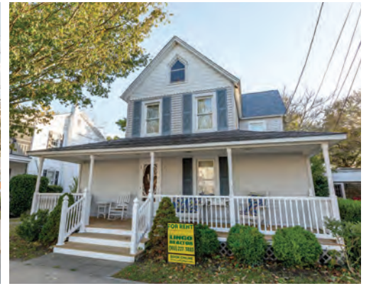
24 CHRISTIAN STREET 4 Bedrooms | 3 Baths | Sleeps 10 Deck Rates: Call for Rates