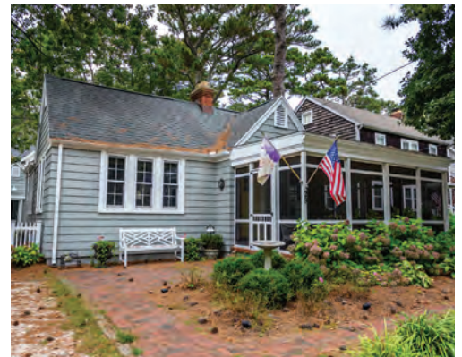
29 COLUMBIA AVENUE 4 Bedrooms | 2 Baths | Sleeps 8 Ocean-Block · Screened Porches · Guest Cottage Rates: Call for Rates