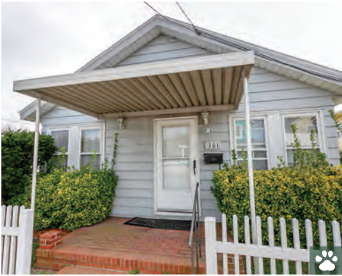
301 E SAVANNAH 3 Bedrooms | 1 Bath | Sleeps 6 Pet-Friendly Rates: $950-$1,500/Week