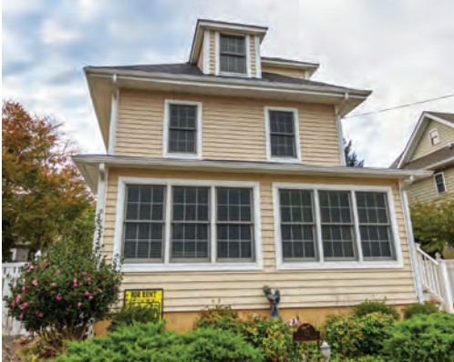
32A DELAWARE AVENUE 3 Bedrooms | 3 Baths | Sleeps 8 Rates: $2,000-$3,900/Week

For more information, please call the Rehoboth Beach office at (302) 227 - 3883 or visit our website at www.JackLingo.com.