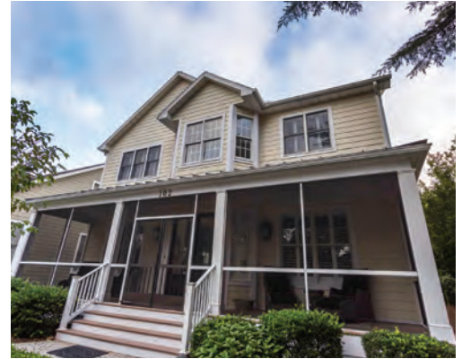
102 ST. LAWRENCE STREET 4 Bedrooms | 3.5 Baths | Sleeps 8 Screened Porches Rates: Call for Rates