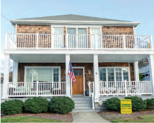
5 NEW CASTLE STREET 6 Bedrooms | 4.5 Baths | Sleeps 12 Ocean-Block · Deck Rates: Call for Rates

For more information, please call the Rehoboth Beach office at (302) 227-3883 or visit our website at www.JackLingo.com .