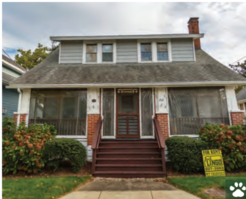
212 PHILADELPHIA STREET 4 Bedrooms | 2.5 Baths | Sleeps 11 Pet-Friendly · Screened Porch Rates: $2,200-$2,800/Week