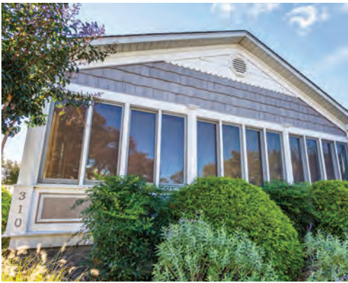
310 SANDALWOOD STREET 4 Bedrooms | 2 Baths | Sleeps 9 Enclosed Porch Rates: Call for Rates