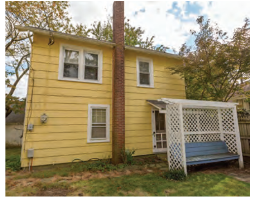
36B PENNSYLVANIA AVENUE—GARAGE APT. 1 Bedroom | 2 Baths | Sleeps 2 Rates: $8,250/Season