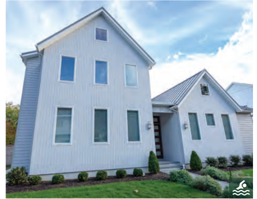
54 SUSSEX STREET 5 Bedrooms | 4.5 Baths | Sleeps 10 Private Pool Rates: $6,000-$10,000/Week