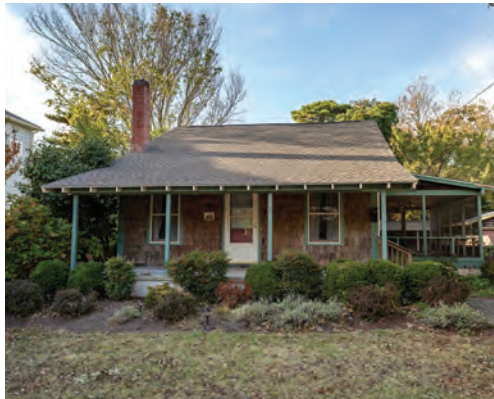
7 HENLOPEN AVENUE 4 Bedrooms | 2.5 Baths | Sleeps 12 Ocean-Block · Screened Porch Rates: Call for Rates