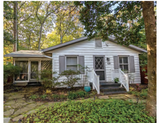
131 COLUMBIA AVENUE 3 Bedrooms | 2 Baths | Sleeps 8 Screened Porch Rates: $1,500-$2,920/Week