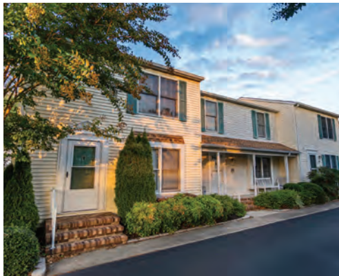
ROBINSON SQUARE 2 Bedrooms | 2.5 Baths | Sleeps 6* Deck Rates: Call for Rates