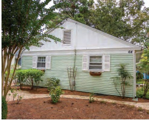
64 HENLOPEN AVENUE 3 Bedrooms | 2 Baths | Sleeps 6 Enclosed Porch Rates: Call for Rates