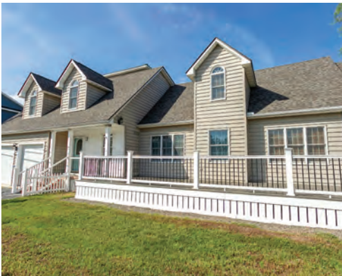
14 TEXAS AVENUE 5 Bedrooms | 3.5 Baths | Sleeps 15 Bay-Block · Screened Porch Rates: $2,300-$4,150/Week