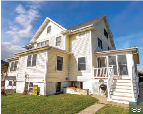
2400 BAY AVENUE 5 Bedrooms | 4.5 Baths | Sleeps 15 Bay-Front · Screened Porch Rates: $4,200-$6,500/Week

For more information, please call the Lewes office at (302) 645 - 2207 or visit our website at www.JackLingo.com .