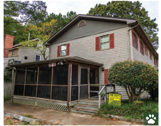
73A & B SUSSEX STREET 3 Bedrooms | 2.5 Baths | Sleeps 8 Pet-Friendly · Screened Porch Rates: Seasonal and Weekly, Call for Rates