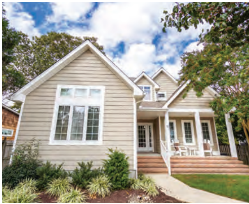
15 STATE ROAD 4 Bedrooms | 3.5 Baths | Sleeps 10 Screened Porch Rates: $1,300-$3,150/Week