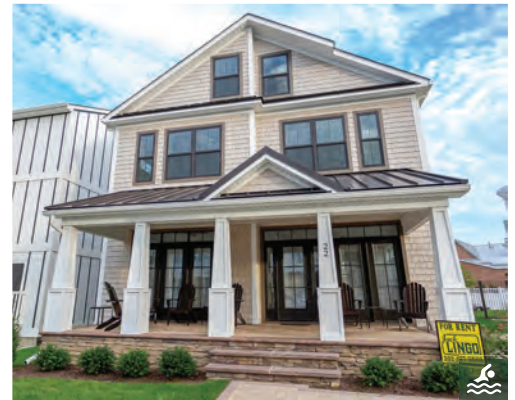
22 LAKE AVENUE 6 Bedrooms | 6.5 Baths | Sleeps 14 Private Pool Rates: $4,000-$9,200/Week