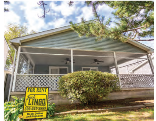
507 SCARBOROUGH AVENUE 3 Bedrooms | 2 Baths | Sleeps 8 Screened Porch Rates: $875-$1,825/Week