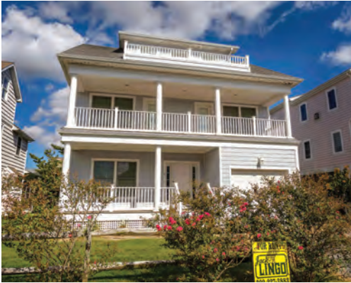
11 HOUSTON STREET 4 Bedrooms | 3.5 Baths | Sleeps 8 Screened Porch Rates: $5,100-$6,500/Week

For more information, please call the Rehoboth Beach office at (302) 227 - 3883 or visit our website at www.JackLingo.com .