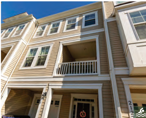
21253 CATALINA CIRCLE 4 Bedrooms | 3.5 Baths | Sleeps 8 Community Pool & Tennis · Fitness Center Rates: Call for Rates