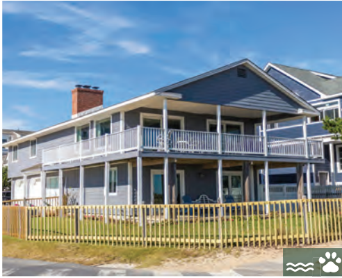
35 SURF AVENUE 5 Bedrooms | 3 Baths | Sleeps 10 Ocean Views · Pet-Friendly · Deck Rates: $4,000–$7,800/Week