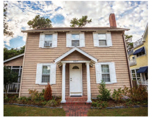
607 KING CHARLES AVENUE 3 Bedrooms | 2.5 Baths | Sleeps 8 Screened Porch Rates: $1,061-$2,897/Week