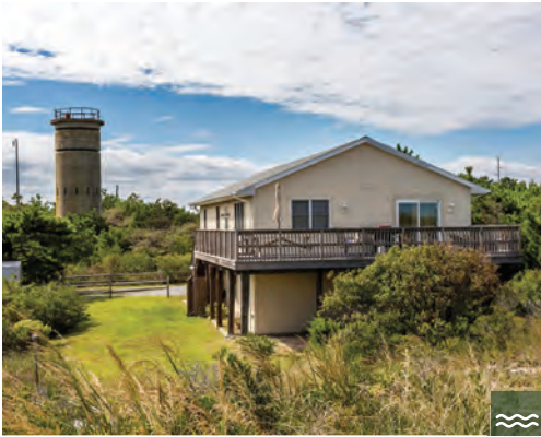
22219 COASTAL HIGHWAY 3 Bedrooms | 2 Baths | Sleeps 8 Ocean-Front · Deck Rates: Call for Rates

For more information, please call the Rehoboth Beach office at (302) 227 - 3883 or visit our website at www.JackLingo.com .