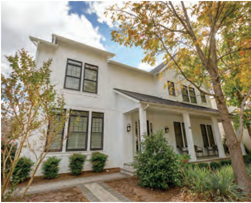
58 SUSSEX STREET 6 Bedrooms | 5.5 Baths | Sleeps 14 Open Porch · Patio Rates: Call for Rates