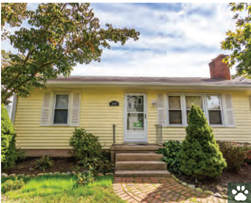
21089 ELIZABETH STREET 2 Bedrooms | 1 Bath | Sleeps 6 Pet-Friendly · Enclosed Porch Rates: $1,350-$1,550/Week