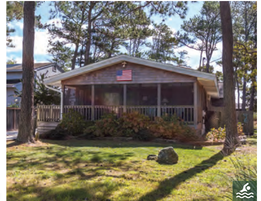
13 CEDAR ROAD 4 Bedrooms | 3 Baths | Sleeps 10 Screened Porch · Community Pool & Tennis Rates: $3,000-$6,600/Week