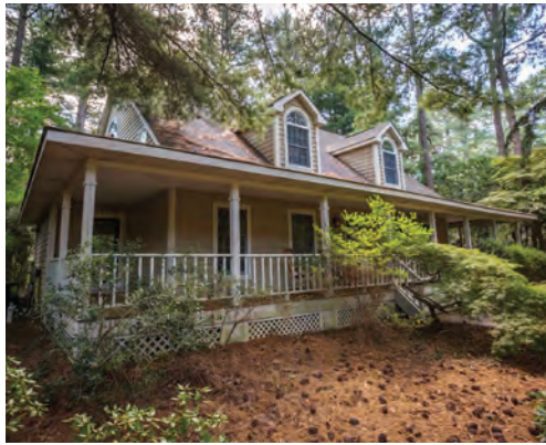
64 FIELDS END ROAD 4 Bedrooms | 4 Baths | Sleeps 10 Screened Porch Rates: $3,200/Week