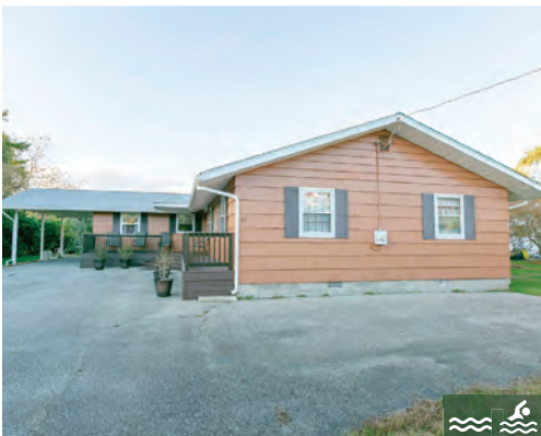
27 HARBOR ROAD 5 Bedrooms | 3 Baths | Sleeps 10 Harbor Views · Enclosed Porch · Community Pool & Tennis Rates: Call for Rates