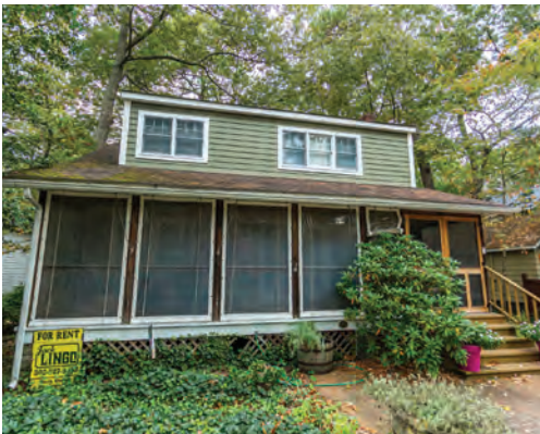
7 4 TH STREET 5 Bedrooms | 2.5 Baths | Sleeps 10 Screened Porches · Deck Rates: $2,150-$2,550/Week