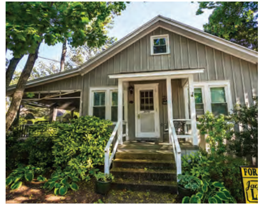
20 OAK AVENUE 4 Bedrooms | 3 Baths | Sleeps 8 Ocean-Block · Screened Porch · Guest House Rates: Call for Rates