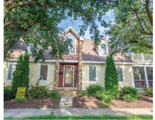
108 SCARBOROUGH AVENUE 5 Bedrooms | 4 Baths | Sleeps 10 Screened Porch · Deck Rates: Call for Rates