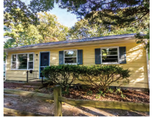
66 HENLOPEN AVENUE 3 Bedrooms | 1.5 Baths | Sleeps 6 Screened Porch Rates: Call for Rates