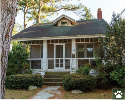
120 NORFOLK STREET 4 Bedrooms | 2 Baths | Sleeps 10 Pet-Friendly · Screened Porch Rates: $2,000-$3,850/Week

For more information, please call the Rehoboth Beach office at (302) 227 - 3883 or visit our website at www.JackLingo.com .