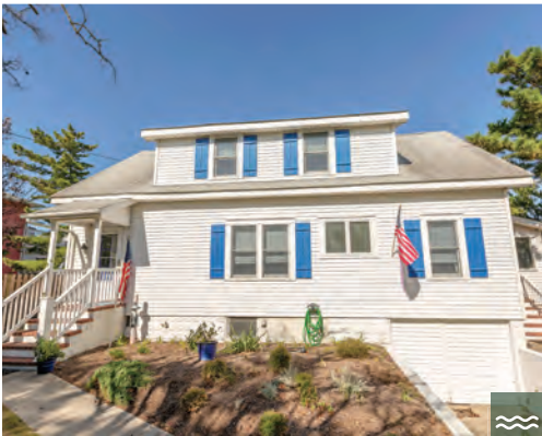
1510 BAY AVENUE 4 Bedrooms | 2 Baths | Sleeps 12 Bay-Front · Enclosed Porch Rates: $4,175-$6,275/Week