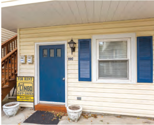
19C MARYLAND AVENUE Maryland Gardens 1 Bedroom | 1 Bath | Sleeps 4 Ocean-Block Rates: $500-$1,100/Week