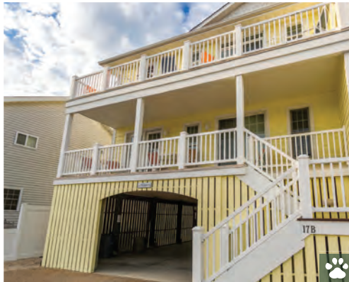
17B CLAYTON STREET 5 Bedrooms | 4.5 Baths | Sleeps 16 Ocean-Block · Pet-Friendly · Enclosed Porches Rates: $2,550-$6,200/Week