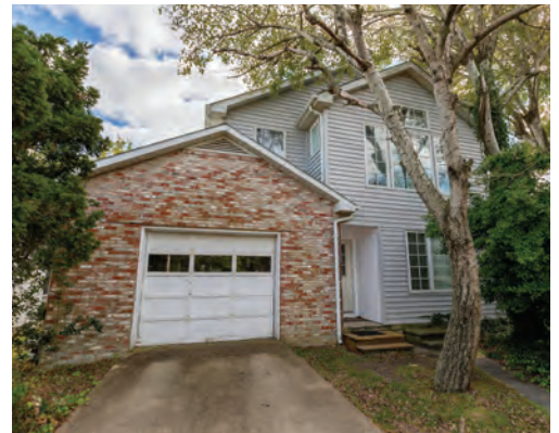
20 PENNSYLVANIA AVENUE 6 Bedrooms | 5 Baths | Sleeps 16 Ocean-Block Rates: Call for Rates