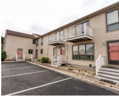
ROSE GARDEN TOWNHOUSES #1, #3, & #9 2 Bedrooms | 1.5 Baths | Sleeps 5-6 Rates: $800-$1,350/Week