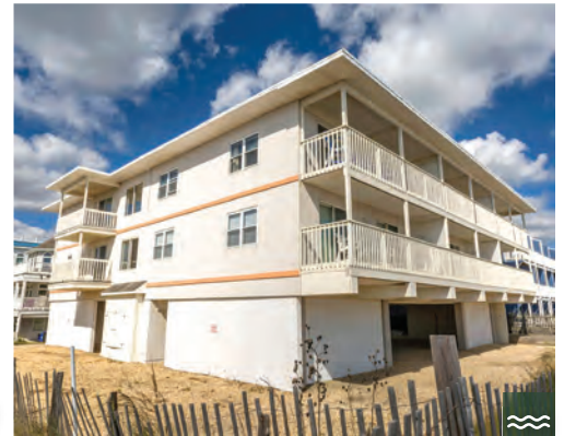
BEACHCOMBER 1 Swedes Street 2 Bedrooms | 1 Bath | Sleeps 6* Ocean-Front Rates: Call for Rates