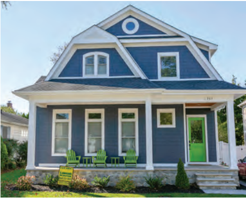
303 SCARBOROUGH AVENUE 5 Bedrooms | 5.5 Baths | Sleeps 12 Screened Porch · Open Porch · Deck Rates: $2,000-$6,500/Week