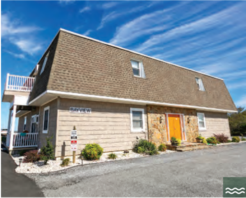
BAYVIEW APARTMENTS, UNITS 3 & 7 2 Bedrooms | 1 Bath | Sleeps 6 Bay-Front Rates: $750-$1,200/Week

For more information, please call the Lewes office at (302) 645 - 2207 or visit our website at www.JackLingo.com .