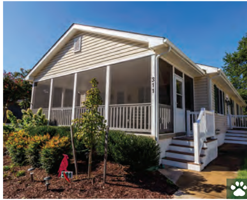
311 STOCKLEY STREET 4 Bedrooms | 2 Baths | Sleeps 8 Pet-Friendly · Screened Porch Rates: Call for Rates