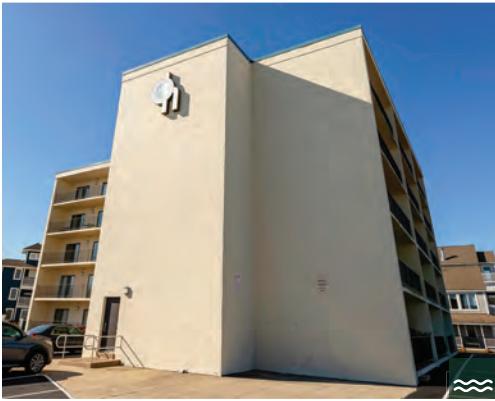
OCEAN HOUSE CONDOMINIUMS 1 Bedroom | 1-1.5 Baths | Sleeps 4-6 Bay-Front Rates: $700-$1,250/Week