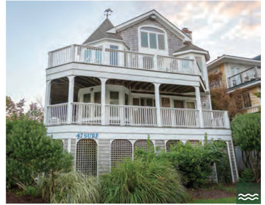
47 SURF AVENUE & PARK 5 Bedrooms | 3 Baths | Sleeps 14 Ocean Views · Elevator · Deck Rates: $2,600–$7,300/Week