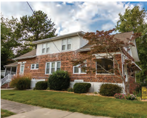
707 BAYARD AVENUE Second Floor 3 Bedrooms | 2 Baths | Sleeps 8 Screened Porch Rates: $1,095-$2,595/Week