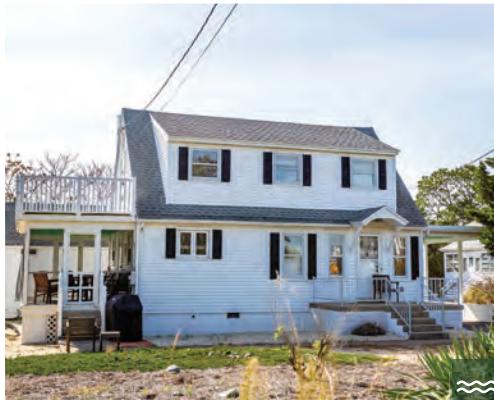
109 OREGON AVENUE 3 Bedrooms | 2 Baths | Sleeps 8 Bay Views · Screened Porch Rates: $1,850-$2,950/Week