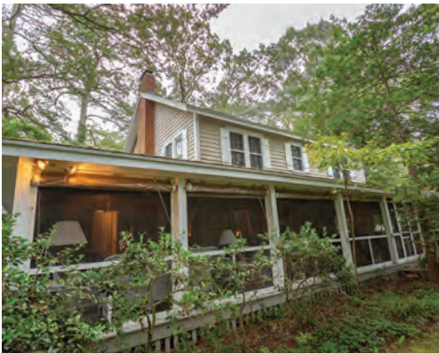
56 PARK AVENUE 7 Bedrooms | 4.5 Baths | Sleeps 16 Screened Porch Rates: Call for Rates