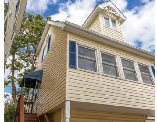
19D MARYLAND AVENUE Maryland Gardens 2 Bedrooms | 2 Baths | Sleeps 6 Ocean-Block Rates: $600-$1,700/Week