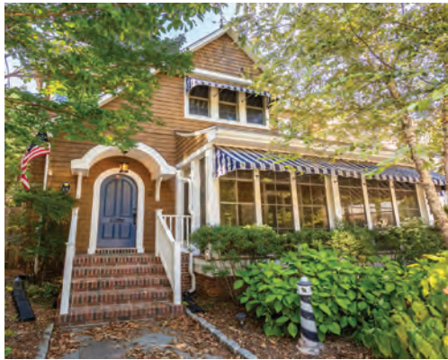
15 OAK AVENUE 5 Bedrooms | 5 Baths | Sleeps 16 Ocean-Block · Screened Porch Rates: $3,600-$8,900/Week