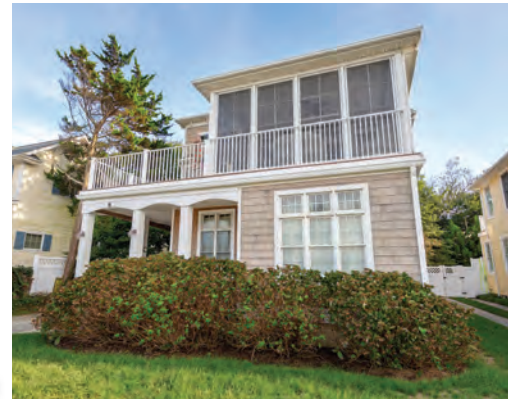
4 NEW CASTLE STREET 6 Bedrooms | 5.5 Baths | Sleeps 12 Ocean-Block · Screened Porch Rates: Call for Rates