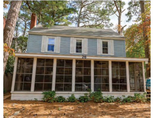
26 HENLOPEN AVENUE 4 Bedrooms | 1.5 Baths | Sleeps 9 Ocean-Block · Screened Porch · Sunroom Rates: Call for Rates