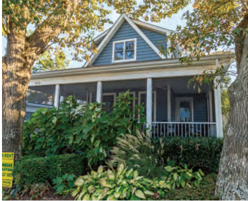
100 NEW CASTLE STREET 4 Bedrooms | 3.5 Baths | Sleeps 10 Screened Porch Rates: $2,600-$6,600/Week