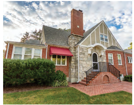
409 BAYARD AVENUE 5 Bedrooms | 3 Baths | Sleeps 18 Enclosed Porch Rates: Call for Rates