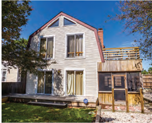
109 HOUSTON STREET 3 Bedrooms | 1.5 Baths | Sleeps 8 Screened Porch Rates: Call for Rates