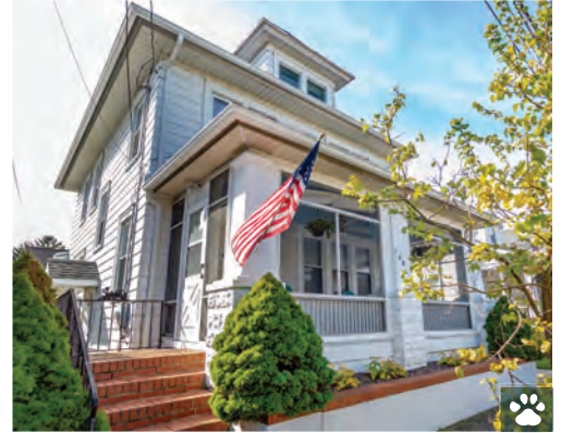
108 BEEBE AVENUE 4 Bedrooms | 2.5 Baths | Sleeps 8 Pet-Friendly · Screened Porch Rates: $1,450-$1,775/Week