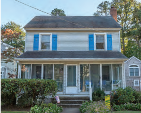
120 STOCKLEY STREET 4 Bedrooms | 2.5 Baths | Sleeps 8 Sunroom Rates: Call for Rates

For more information, please call the Rehoboth Beach office at (302) 227 - 3883 or visit our website at www.JackLingo.com.