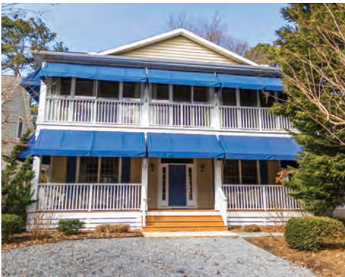
23 COLUMBIA AVENUE 4 Bedrooms | 3.5 Baths | Sleeps 12 Ocean-Block · Open Porch · Deck Rates: $4,095-$6,600/Week