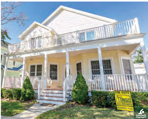
37 MARYLAND AVENUE 5 Bedrooms | 4.5 Baths | Sleeps 20 Private Pool · Screened Porch Rates: Call for Rates