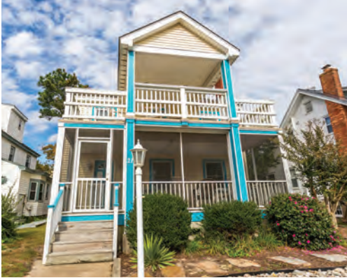
21 LAKE AVENUE 5 Bedrooms | 2 Baths | Sleeps 12 Ocean-Block · Screened Porch Rates: Call for Rates

For more information, please call the Rehoboth Beach office at (302) 227 - 3883 or visit our website at www.JackLingo.com .