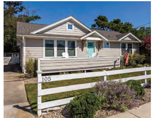
105 ST. LOUIS STREET 3 Bedrooms | 2 Baths | Sleeps 8 Screened Porch Rates: $3,000/Week