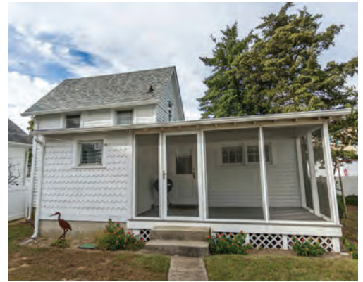
39B DELAWARE AVENUE 3 Bedrooms | 1 Bath | Sleeps 3 Screened Porch Rates: Call for Rates