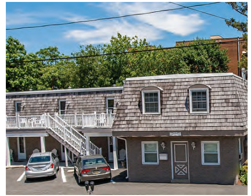
29 MARYLAND AVENUE Pine & Brine Efficiency | 1 Bath | Sleeps 4* Ocean-Block Rates: Call for Rates