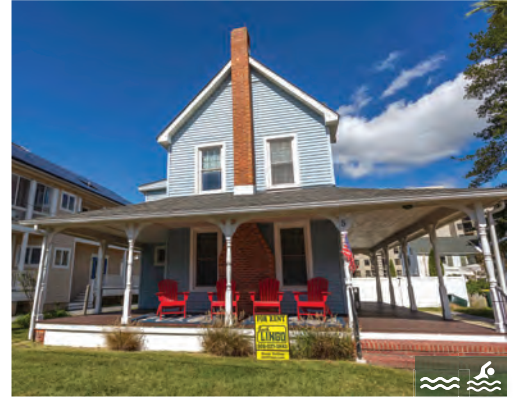
5 OLIVE AVENUE 4 Bedrooms | 3 Baths | Sleeps 10 Ocean-Block · Ocean Views · Private Pool Rates: $2,925-$6,850/Week