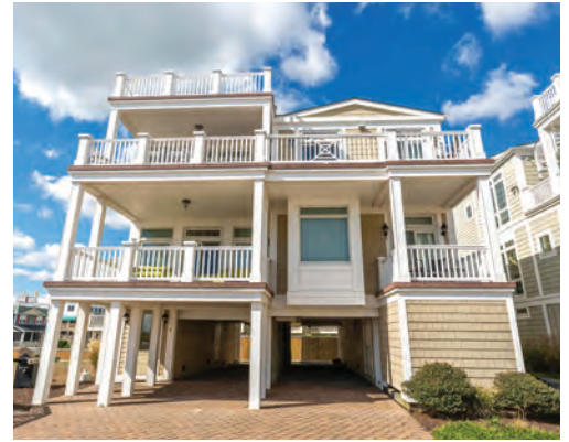
9 CLAYTON STREET 5 Bedrooms | 5.5 Baths | Sleeps 11 Ocean-Block · Decks Rates: $4,500-$8,200/Week