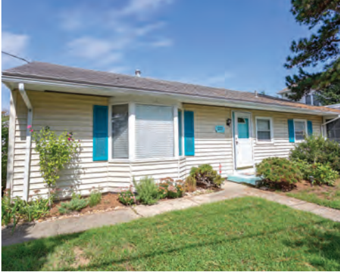
227 MUNSON STREET 4 Bedrooms | 1 Bath | Sleeps 8 Screened Porch Rates: $2,000-$2,250/Week

For more information, please call the Rehoboth Beach office at (302) 227 - 3883 or visit our website at www.JackLingo.com.