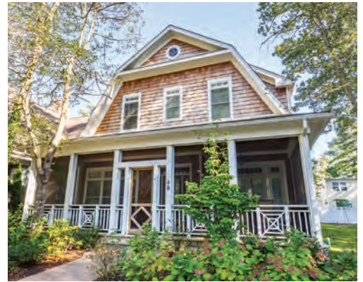
48 PARK AVENUE 5 Bedrooms | 5.5 Baths | Sleeps 12 Screened Porch · Electric-Car Outlet Rates: $3,500–$9,500/Week