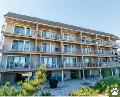
OCEAN VIEW 3 Bedrooms | 2 Baths | Sleeps 6-8 Ocean-Block · Pet-Friendly Rates: Call for Rates