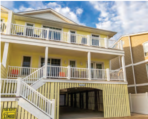
17A CLAYTON STREET 5 Bedrooms | 4.5 Baths | Sleeps 16 Ocean-Block · Enclosed Porches Rates: $2,550-$6,200/Week