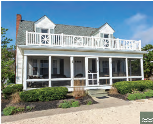
507 SOUTH BOARDWALK 5 Bedrooms | 3.5 Baths | Sleeps 12 Ocean-Front · Screened Porch Rates: $3,700-$8,200/Week