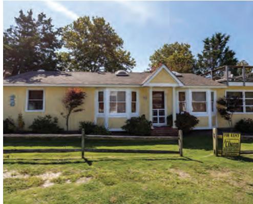
16 WEST STREET 4 Bedrooms | 2 Baths | Sleeps 10 Ocean-Block · Rooftop Deck Rates: $2,015-$2,910/Week