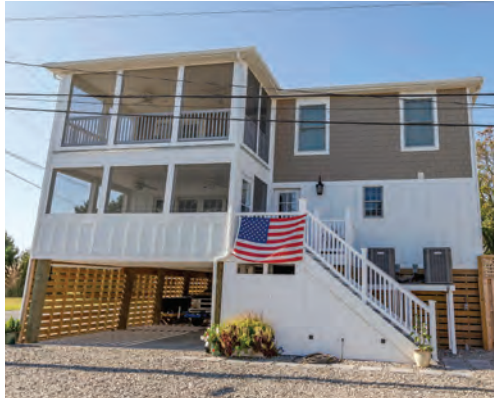
312 E MARKET STREET, #2 4 Bedrooms | 3.5 Baths | Sleeps 10 Screened Porch Rates: $2,250-$3,450/Week