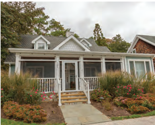
103 RODNEY STREET 7 Bedrooms | 6.5 Baths | Sleeps 16 Guest Cottage · Screened Porch · Hot Tub Rates: $1,800-$8,800/Week