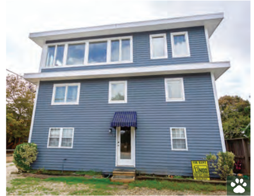
20B WEST STREET 5 Bedrooms | 2 Baths | Sleeps 13 Ocean-Block · Pet-Friendly · Sun Porch Rates: $2,600-$3,450/Week