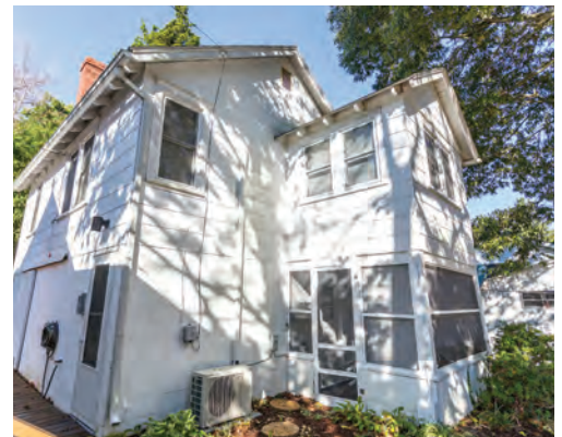
209.5 MUNSON STREET Garage Apartment 2 Bedrooms | 1 Bath | Sleeps 4 Screened Porch Rates: Call for Rates