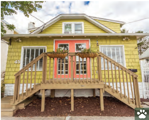
45 BALTIMORE AVENUE 4 Bedrooms | 4.5 Baths | Sleeps 10 Pet-Friendly Rates: $1,600-$4,875/Week