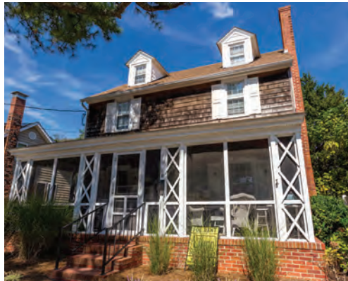
13 NORFOLK STREET 5 Bedrooms | 1.5 Baths | Sleeps 12 Ocean-Block · Screened Porch Rates: $2,450-$5,045/Week