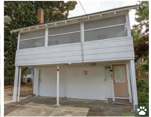
208B HICKMAN STREET 1 Bedroom | 1 Bath | Sleeps 2 Pet-Friendly · Screened Porch Rates: Call for Rates