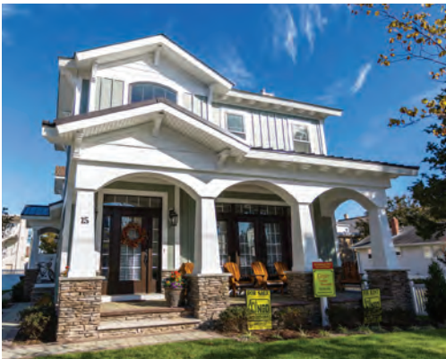
15 DELAWARE AVENUE 5 Bedrooms | 4.5 Baths | Sleeps 20 Ocean-Block · Open Porch · Patio Rates: $4,510-$9,900/Week