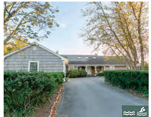
316 SALISBURY STREET 7 Bedrooms | 3.5 Baths | Sleeps 14 Bay-Front · Private Pool Rates: $7,500-$13,000/Week