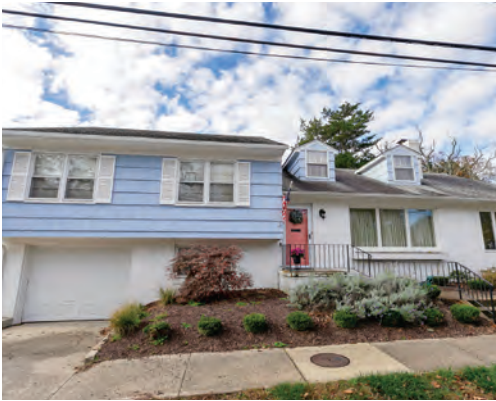
34 PENNSYLVANIA AVENUE 6 Bedrooms | 4 Baths | Sleeps 12 Enclosed Porch Rates: Call for Rates