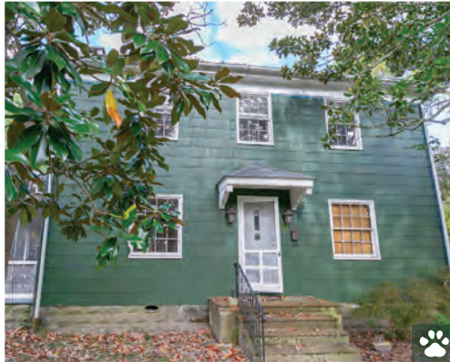
17 HENLOPEN AVENUE 3 Bedrooms | 3 Baths | Sleeps 11 Pet-Friendly · Ocean-Block · Screened Porch Rates: $1,400-$2,150/Week