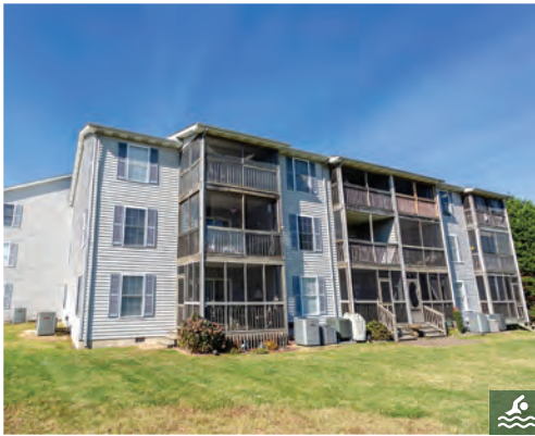
BEACHAVEN CONDOMINIUMS 2 Bedrooms | 2 Baths | Sleeps 4* Community Pool · Screened Porch Rates: $550-$925/Week