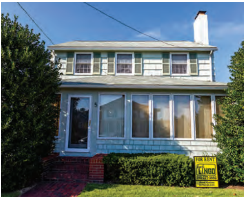
5 RODNEY STREET 3 Bedrooms | 1.5 Baths | Sleeps 8 Ocean-Block · Enclosed Porch Rates: Call for Rates