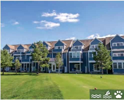
HERITAGE VILLAGE-TOWNHOMES 3 Bedrooms | 3.5 Baths | Sleeps 6-10 Pond/Golf-Course Views · Pet-Friendly · Community Pool Rates: $1,000-$1,600/Week