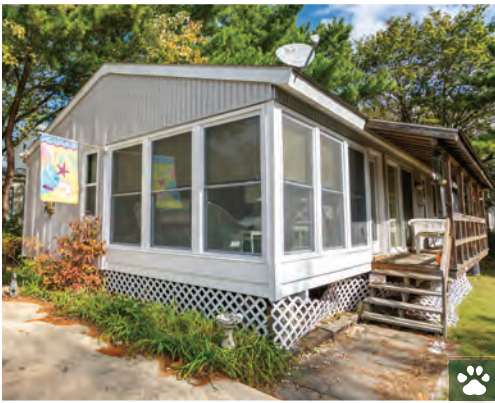
21155 FIRST STREET 3 Bedrooms | 2 Baths | Sleeps 10 Pet-Friendly · Enclosed Porch Rates: $800-$1,495/Week