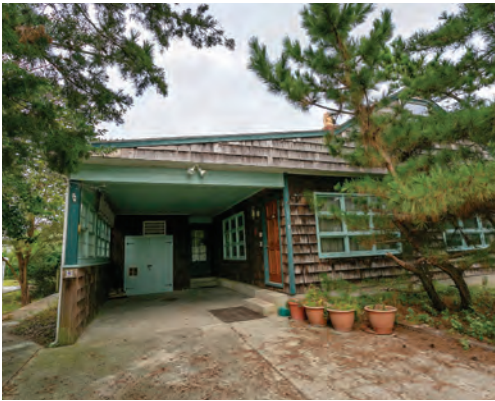
8 OHIO AVENUE 6 Bedrooms | 4 Baths | Sleeps 16 Bay-Block · Enclosed Porch Rates: $1,750-$2,950/Week