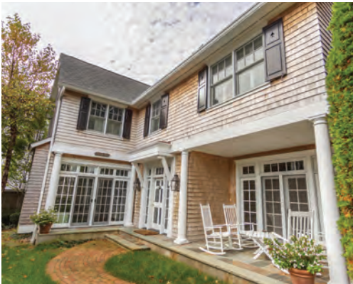
92 SUSSEX STREET 4 Bedrooms | 3.5 Baths | Sleeps 8 Open Porch Rates: $2,625-$4,925/Week