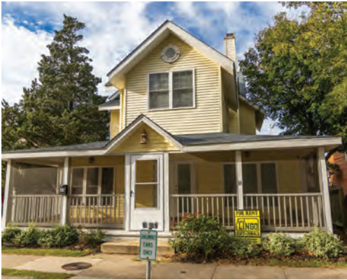
33 BROOKLYN AVENUE 6 Bedrooms | 4.5 Baths | Sleeps 12 Screened Porch · Deck Rates: $4,100-$6,200/Week