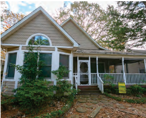
50 HENLOPEN AVENUE 4 Bedrooms | 3 Baths | Sleeps 8 Screened Porch Rates: $2,400-$3,850/Week