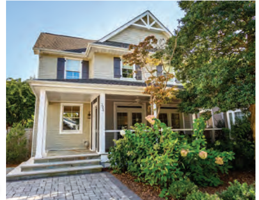
226 NORFOLK STREET 4 Bedrooms | 3.5 Baths | Sleeps 8 Screened Porches Rates: Call for Rates