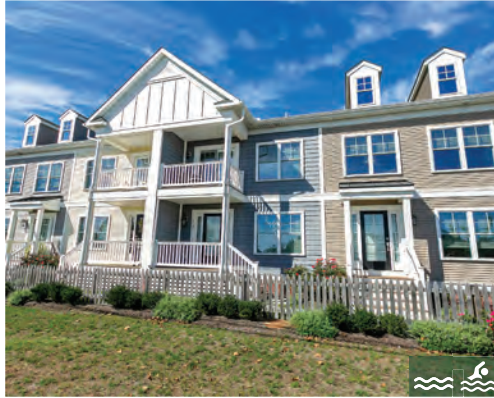
CANAL PLACE, UNIT 4A 3 Bedrooms | 2.5 Baths | Sleeps 6 Canal Views · Community Pool Rates: $1,150-$2,150/Week