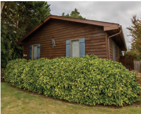
38148 TERRACE ROAD 3 Bedrooms | 1.5 Baths | Sleeps 6 Sunroom · Deck Rates: $1,500-$2,200/Week