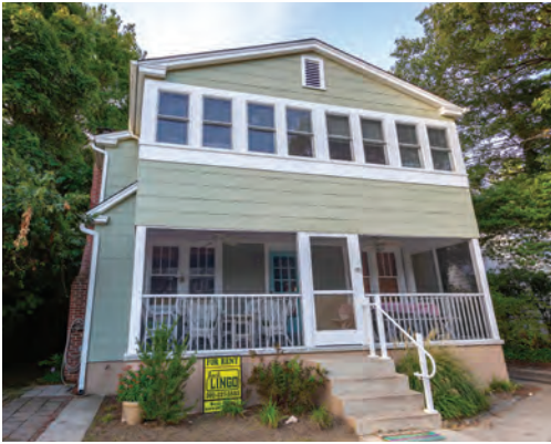
119 NEW CASTLE STREET 12 Bedrooms | 4.5 Baths | Sleeps 27 Screened Porch · Patio Rates: $3,600-$7,400/Week