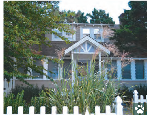
38154 TERRACE ROAD 4 Bedrooms | 2 Baths | Sleeps 7 Pet-Friendly · Screened Porches Rates: Call for Rates