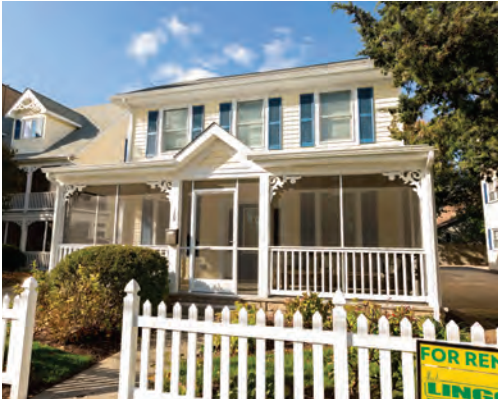
19 MARYLAND AVENUE 5 Bedrooms | 3.5 Baths | Sleeps 10 Ocean-Block · Screened Porch Rates: Call for Rates

For more information, please call the Rehoboth Beach office at (302) 227 - 3883 or visit our website at www.JackLingo.com.