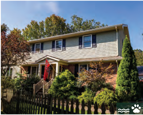
310 STOCKLEY STREET 5 Bedrooms | 3.5 Baths | Sleeps 15 Lake-Front · Pet-Friendly · Private Dock Rates: $1,600-$3,200/Week