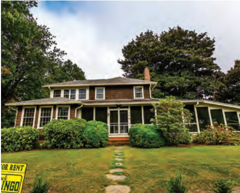
14 HENLOPEN AVENUE 5 Bedrooms | 3 Baths | Sleeps 10 Ocean-Block · Screened Porch Rates: $5,950/Week

For more information, please call the Rehoboth Beach office at (302) 227 - 3883 or visit our website at www.JackLingo.com .