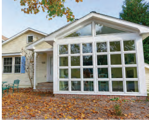
305 STOCKLEY STREET 3 Bedrooms | 3 Baths | Sleeps 6 Patio Rates: Call for Rates