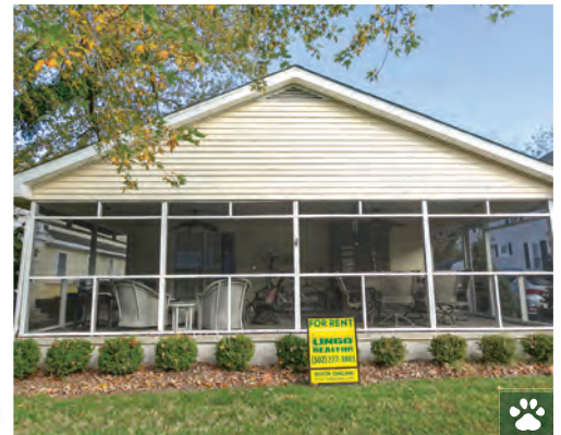
227 PHILADELPHIA STREET 4 Bedrooms | 2 Baths | Sleeps 8 Pet-Friendly · Screened Porch Rates: Call for Rates