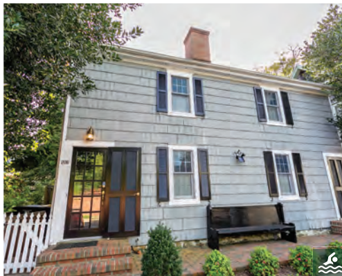
208 E THIRD STREET 4 Bedrooms | 4 Baths | Sleeps 10 Private Pool Rates: $3,250-$3,950/Week