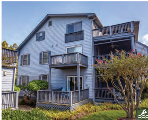
SNUG HARBOR Harbor & Cedar Road 2-3 Bedrooms | 1-2 Baths | Sleeps 4-5* Screened Porch · Community Pool & Tennis Rates: $1,100-$2,300/Week