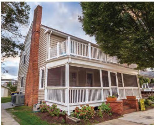
42 MARYLAND AVENUE 5 Bedrooms | 2 Baths | Sleeps 12 Screened Porch Rates: Call for Rates