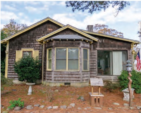
5 HENLOPEN AVENUE 4 Bedrooms | 2 Baths | Sleeps 8 Ocean-Block · Deck Rates: Call for Rates