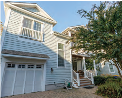
118H PHILADELPHIA STREET 5 Bedrooms | 6 Baths | Sleeps 14 Screened Porch Rates: $2,200-$6,400/Week