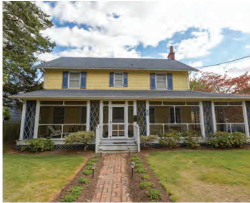
36 PENNSYLVANIA AVENUE 4 Bedrooms | 2 Baths | Sleeps 10 Screened Porch Rates: $25,750/Season