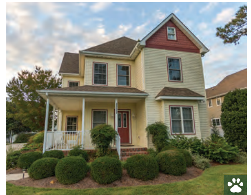
38223 ROBINSONS DRIVE 4 Bedrooms | 3 Baths | Sleeps 12 Pet-Friendly · Screened Porch Rates: $2,000-$3,500/Week