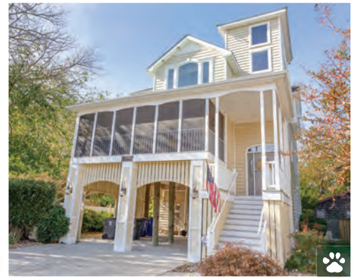
20968 ANN AVENUE 6 Bedrooms | 4.5 Baths | Sleeps 16 Pet-Friendly · Screened Porch · Deck Rates: Call for Rates