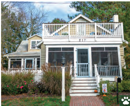
217 RODNEY STREET 6 Bedrooms | 5 Baths | Sleeps 14 Pet-Friendly · Screened Porch Rates: Call for Rates