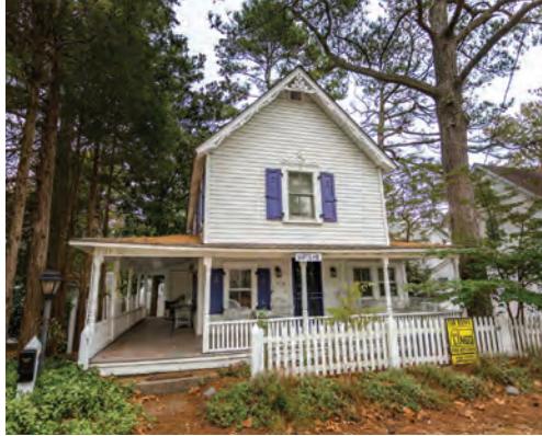
31 1 ST STREET 3 Bedrooms | 1.5 Baths | Sleeps 8 Ocean-Block Rates: Call for Rates