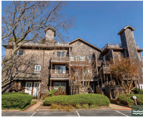
130 BAY AVENUE, APT. D 2 Bedrooms | 2 Baths | Sleeps 6 Bay-Front · Enclosed Porch Rates: $1,000-$2,000/Week