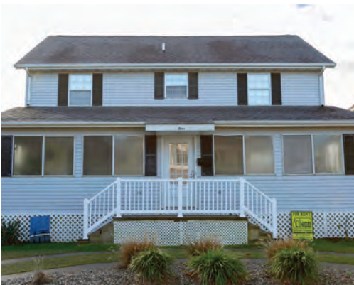
4 QUEEN STREET 5 Bedrooms | 3 Baths | Sleeps 12 Ocean-Block · Enclosed Porch Rates: Call for Rates