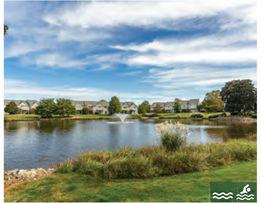
SPRING LAKE COMMUNITY 1-4 Bedrooms | 1.5-3.5 Baths | Sleeps 4-10* Community Pool Rates: Call for Rates, Weekly & Seasonal Available