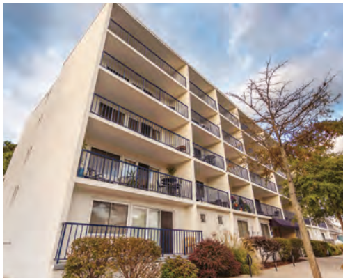
THE ARK-REHOBOTH AVENUE 1 Bedroom | 1 Bath | Sleeps 4* Elevator Rates: Call for Rates