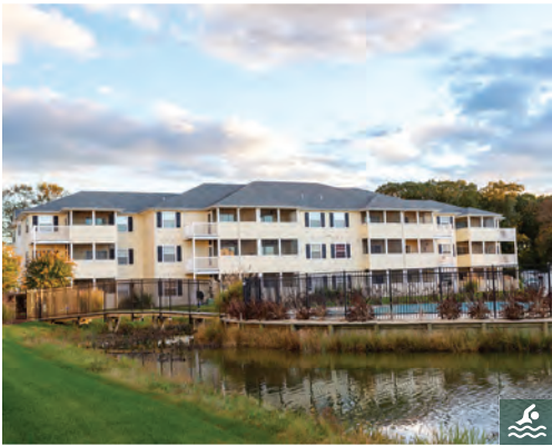
THE PALMS 3-5 Bedrooms | 2-3.5 Baths | Sleeps 6-10* Community Pool · Screened Porch Rates: Call for Rates