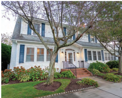
14 PENNSYLVANIA AVENUE 5 Bedrooms | 3.5 Baths | Sleeps 17 Ocean-Block · Deck Rates: $5,100-$5,900/Week