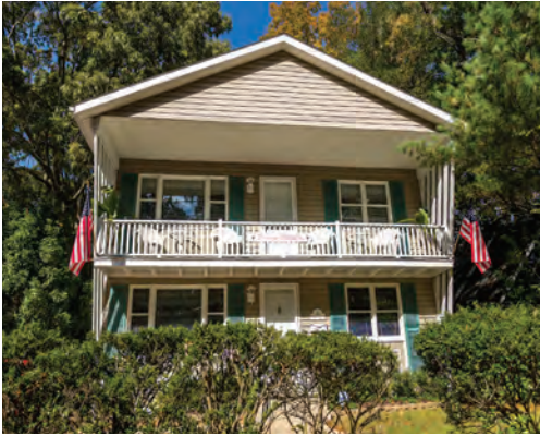
143B COLUMBIA AVENUE—SECOND FLOOR 3 Bedrooms | 1 Bath | Sleeps 6 Open Porch Rates: $656.25–$1,249/Week

For more information, please call the Rehoboth Beach office at (302) 227 - 3883 or visit our website at www.JackLingo.com .