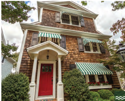
27 VIRGINIA AVENUE 5 Bedrooms | 3.5 Baths | Sleeps 11 Ocean-Block · Lake Views · Screened Porch Rates: Call for Rates