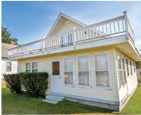
10 CAPE HENLOPEN DRIVE 3 Bedrooms | 1.5 Baths | Sleeps 11 Enclosed Porch Rates: $1,550-$1,750/Week