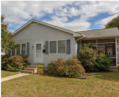
302 STATE ROAD 3 Bedrooms | 2 Baths | Sleeps 8 Screened Porch Rates: Call for Rates