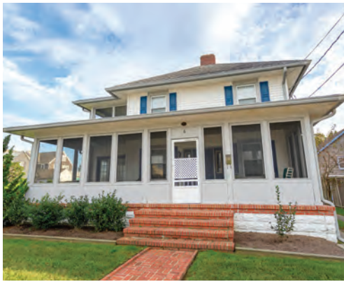
6A RODNEY STREET 4 Bedrooms | 1.5 Baths | Sleeps 8 Ocean-Block · Screened Porch Rates: Call for Rates