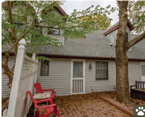
38373 F BENSON STREET, #4 2 Bedrooms | 1 Bath | Sleeps 4 Pet-Friendly · Deck Rates: Call for Rates