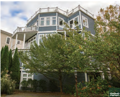
38285 BLACKSTONE AVENUE 4 Bedrooms | 4.5 Baths | Sleeps 8 Rooftop Deck · Lake Views Rates: Call for Rates