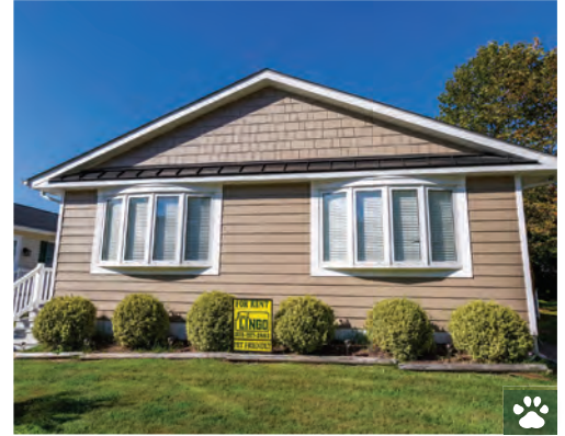
309 STOCKLEY STREET 3 Bedrooms | 2 Baths | Sleeps 8 Pet-Friendly · Patio Rates: Call for Rates