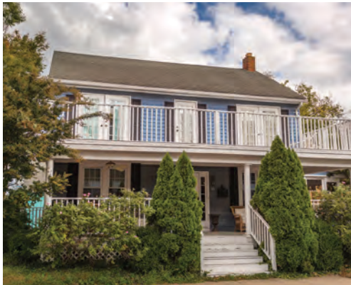
60 BALTIMORE AVENUE 5 Bedrooms | 5.5 Baths | Sleeps 10 Screened Porch Rates: $2,020-$4,120/Week