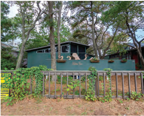
103 WEST STREET 3 Bedrooms | 2 Baths | Sleeps 6 Screened Porch Rates: Call for Rates