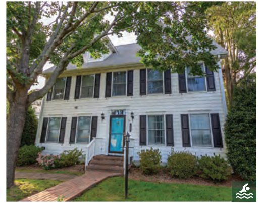
503 STOCKLEY STREET EXTENDED 6 Bedrooms | 4.5 Baths | Sleeps 12 Private Pool Rates: Call for Rates