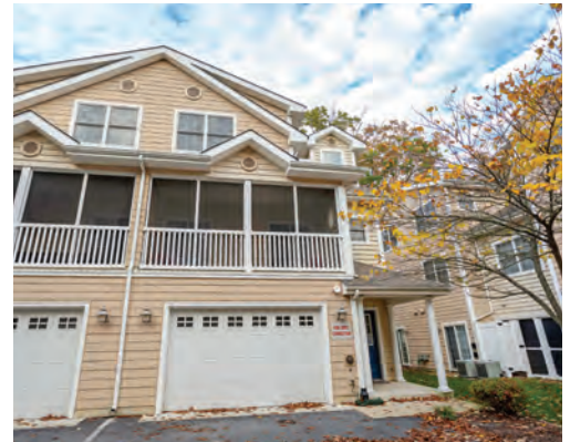
506F REHOBOTH AVENUE Cottages by the Sea 4 Bedrooms | 4.5 Baths | Sleeps 10 Screened Porch Rates: $1,800-$2,500/Week