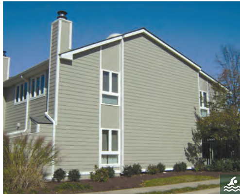
SCARBOROUGH VILLAGE TOWNHOUSES 2 Bedrooms | 1.5-2.5 Baths | Sleeps 6* Community Pool · Deck Rates: Call for Rates