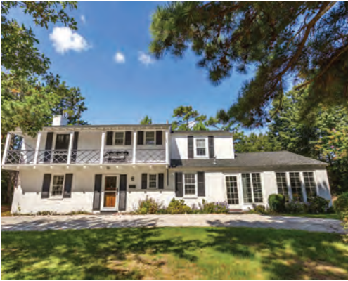
5 ROLLING ROAD 4 Bedrooms | 3 Baths | Sleeps 10 Ocean-Block · Enclosed Porch Rates: Call for Rates

For more information, please call the Rehoboth Beach office at (302) 227 - 3883 or visit our website at www.JackLingo.com.