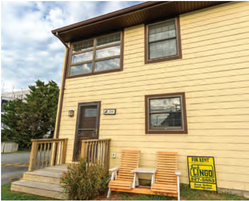
218 BAYARD AVENUE 3 Bedrooms | 2 Baths | Sleeps 8 Rates: $850-$2,150/Week

For more information, please call the Rehoboth Beach office at (302) 227 - 3883 or visit our website at www.JackLingo.com .