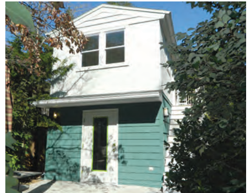
11 1/2 HENLOPEN AVENUE 2 Bedrooms | 1 Bath | Sleeps 4 Ocean-Block Rates: $9,750/Season