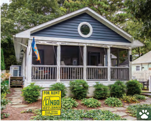
62 HENLOPEN AVENUE 4 Bedrooms | 3 Baths | Sleeps 10 Pet-Friendly · Screened Porch Rates: $1,595-$5,775/Week

For more information, please call the Rehoboth Beach office at (302) 227 - 3883 or visit our website at www.JackLingo.com .