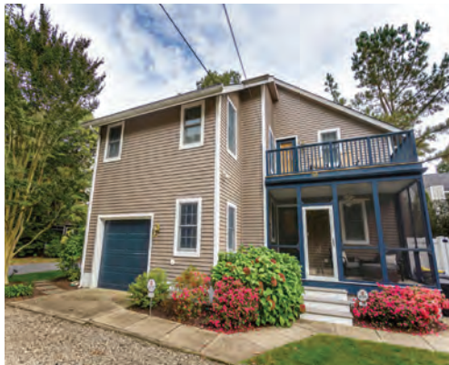
58 HENLOPEN AVENUE 5 Bedrooms | 3 Baths | Sleeps 10 Screened Porches Rates: $1,550-$6,200/Week