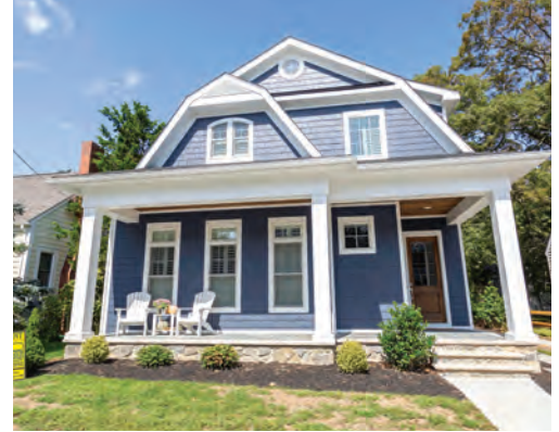
109 NEW CASTLE STREET 5 Bedrooms | 5.5 Baths | Sleeps 10 Screened Porch Rates: Call for Rates