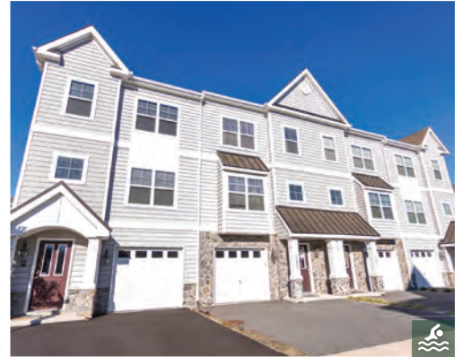
REHOBOTH CROSSING 3-4 Bedrooms | 3.5 Baths | Sleeps 6-10* Community Pool · Fitness Center · Screened Porch Rates: Call for Rates