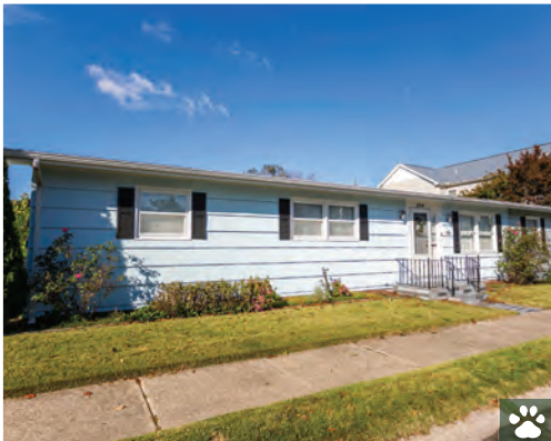
208 COUNTRY CLUB DRIVE 4 Bedrooms | 3 Baths | Sleeps 8 Pet-Friendly · Enclosed Porch Rates: $2,295-$2,495/Week