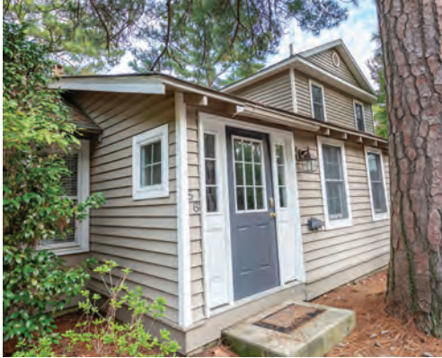
56 KENT STREET 5 Bedrooms | 2 Baths | Sleeps 10 Screened Porch · Deck Rates: Call for Rates