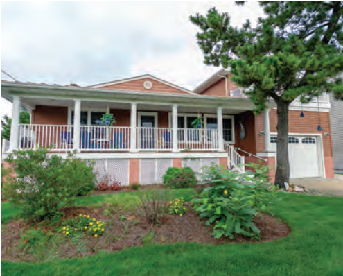
7 CAMDEN AVENUE 3 Bedrooms | 3.5 Baths | Sleeps 9 Sunroom Rates: $1,450-$2,450/Week

For more information, please call the Lewes office at (302) 645 - 2207 or visit our website at www.JackLingo.com .