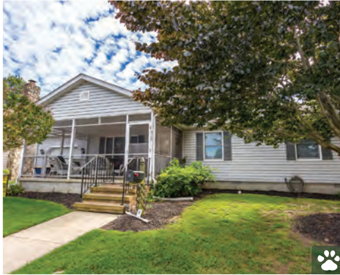
310 HICKMAN STREET 3 Bedrooms | 2 Baths | Sleeps 10 Pet-Friendly · Screened Porches Rates: $1,025-$2,595/Week