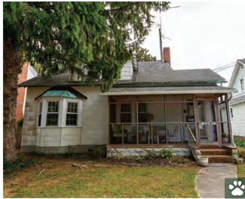
208A HICKMAN STREET 4 Bedrooms | 2 Baths | Sleeps 10 Pet-Friendly · Screened Porch Rates: Call for Rates