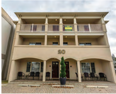
20A & B WILMINGTON AVENUE 7 Bedrooms | 5.5 Baths | Sleeps 16 Ocean-Block · Rooftop Deck Rates: $3,500-$7,500/Week