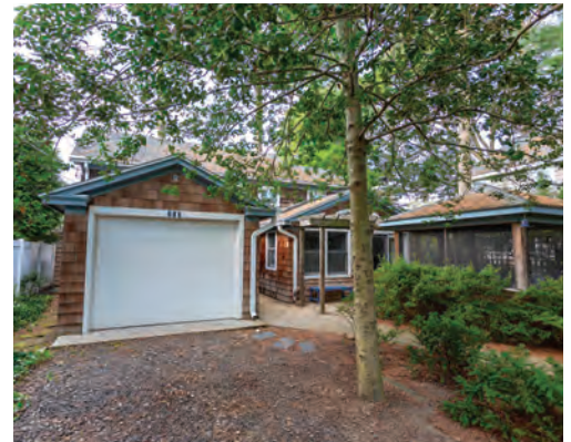
117 NORFOLK STREET 4 Bedrooms | 2 Baths | Sleeps 8 Screened Porch Rates: Call for Rates