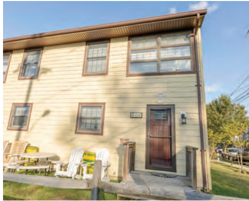
220 BAYARD AVENUE 3 Bedrooms | 2 Baths | Sleeps 8 Rates: $850-$2,150/Week