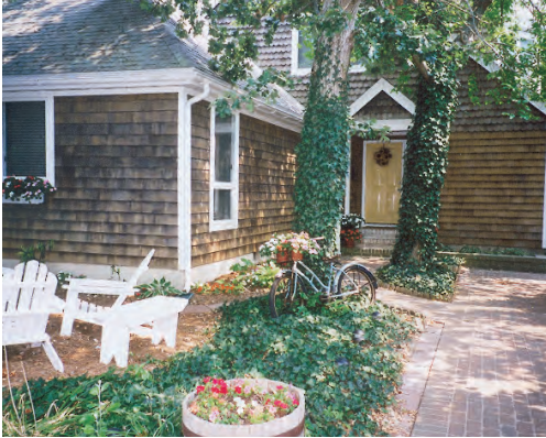
22 PENNSYLVANIA AVENUE 5 Bedrooms | 4.5 Baths | Sleeps 14 Ocean-Block · Screened Porch Rates: $4,500-$5,600/Week

For more information, please call the Rehoboth Beach office at (302) 227 - 3883 or visit our website at www.JackLingo.com.