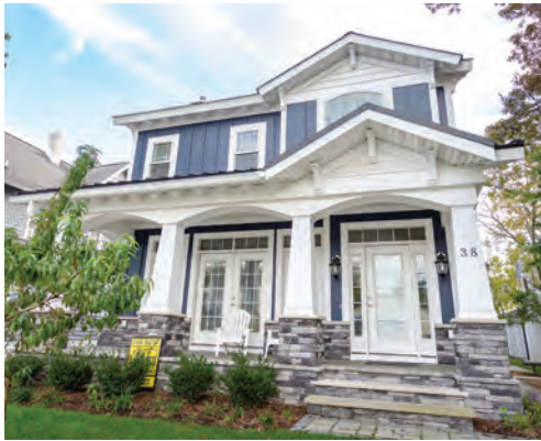
38 DELAWARE AVENUE 5 Bedrooms | 4.5 Baths | Sleeps 12 Open Porch · Patio Rates: $3,500-$7,500/Week