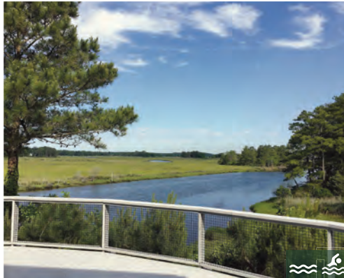
91 ANCHOR ROAD 6 Bedrooms | 3.5 Baths | Sleeps 12 Canal-Front · Screened Porches · Community Pool & Tennis Rates: $6,900-$9,800/Week