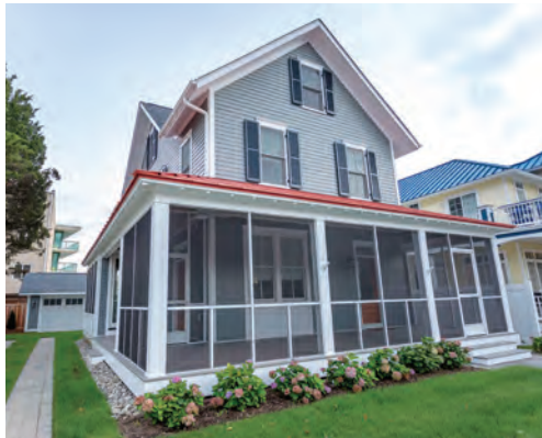
14 MARYLAND AVENUE 6 Bedrooms | 5 Baths | Sleeps 14 Ocean-Block · Screened Porch Rates: $5,000-$11,000/Week