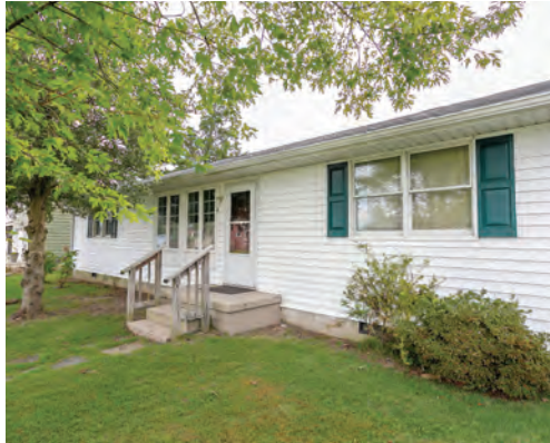
4 CLAYTON 4 Bedrooms | 2 Baths | Sleeps 8 Screened Porch Rates: $1,200-$2,200/Week