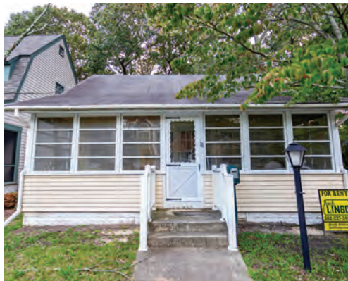
11 4 TH STREET Front & Garage Units 3 Bedrooms | 1 Bath | Sleeps 4-8 Enclosed Porch (Front Unit) Rates: Call for Rates