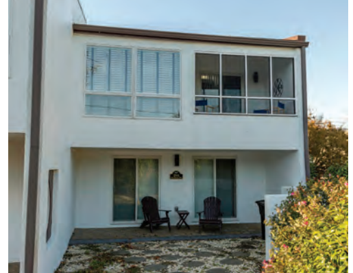
33B DELAWARE AVENUE 3 Bedrooms | 2.5 Baths | Sleeps 8 Screened Porch Rates: $1,500-$2,995/Week