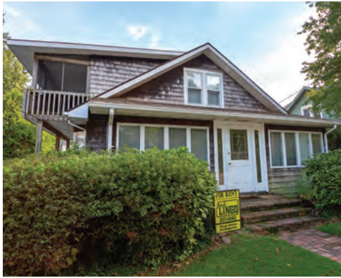
120 NEW CASTLE STREET 6 Bedrooms | 4.5 Baths | Sleeps 15 Screened Porches Rates: Call for Rates