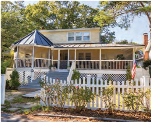
47 OAK AVENUE 5 Bedrooms | 3 Baths | Sleeps 10 Screened Porch · Deck Rates: $2,000-$5,900/Week

For more information, please call the Rehoboth Beach office at (302) 227 - 3883 or visit our website at www.JackLingo.com .