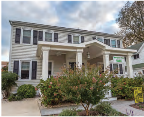
34A OLIVE AVENUE 5 Bedrooms | 2.5 Baths | Sleeps 13 Open Porch · Deck Rates: Call for Rates